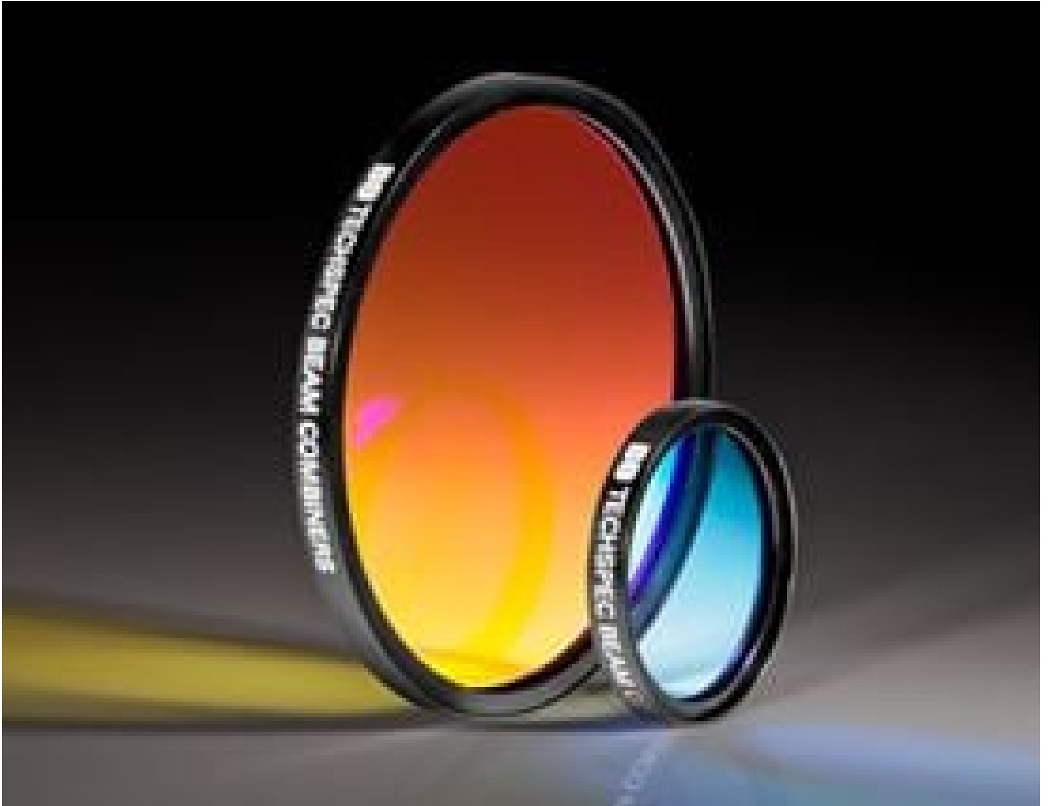
TECHSPEC® Dichroic Laser Beam Combiners