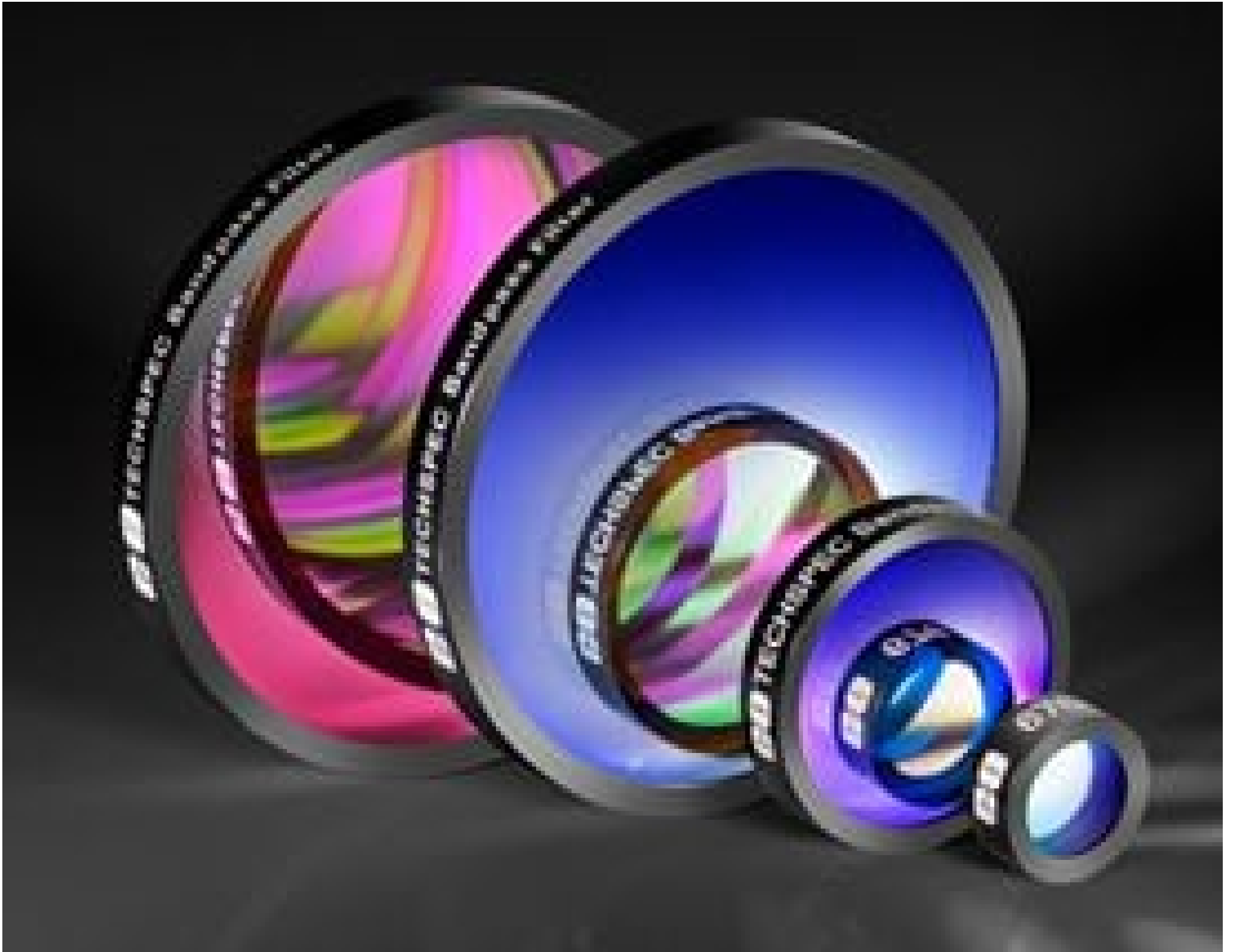
TECHSPEC Hard Coated OD 4.0 10nm Bandpass Filters