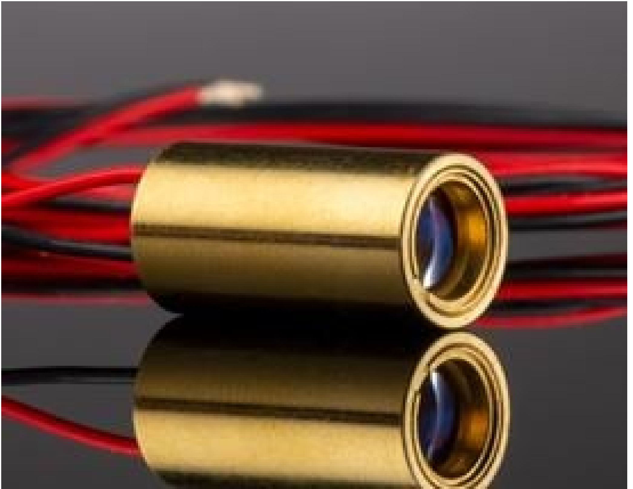
Coherent® Micro VLM™ Laser Diode