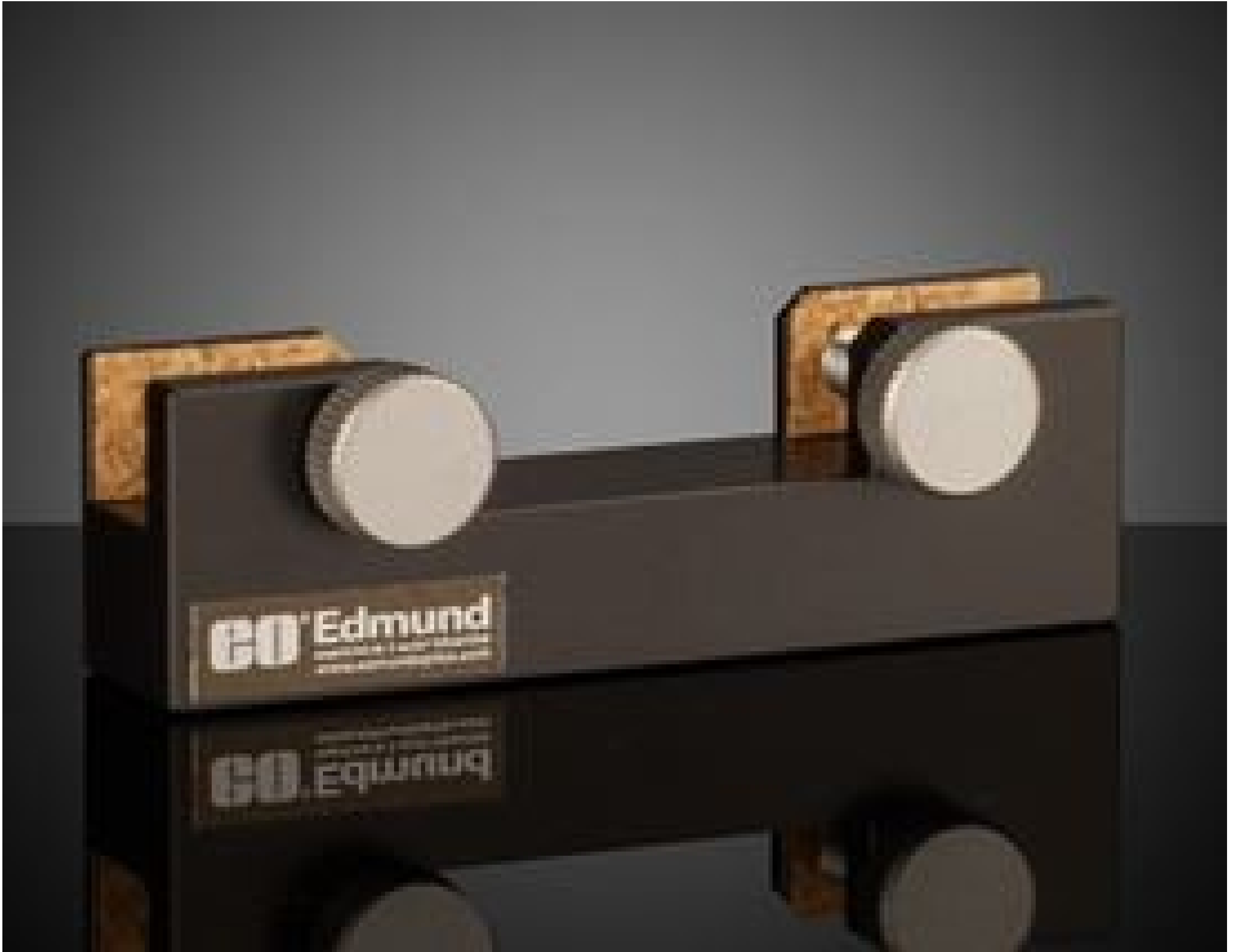
40mm Sq., Fixed Filter Holder