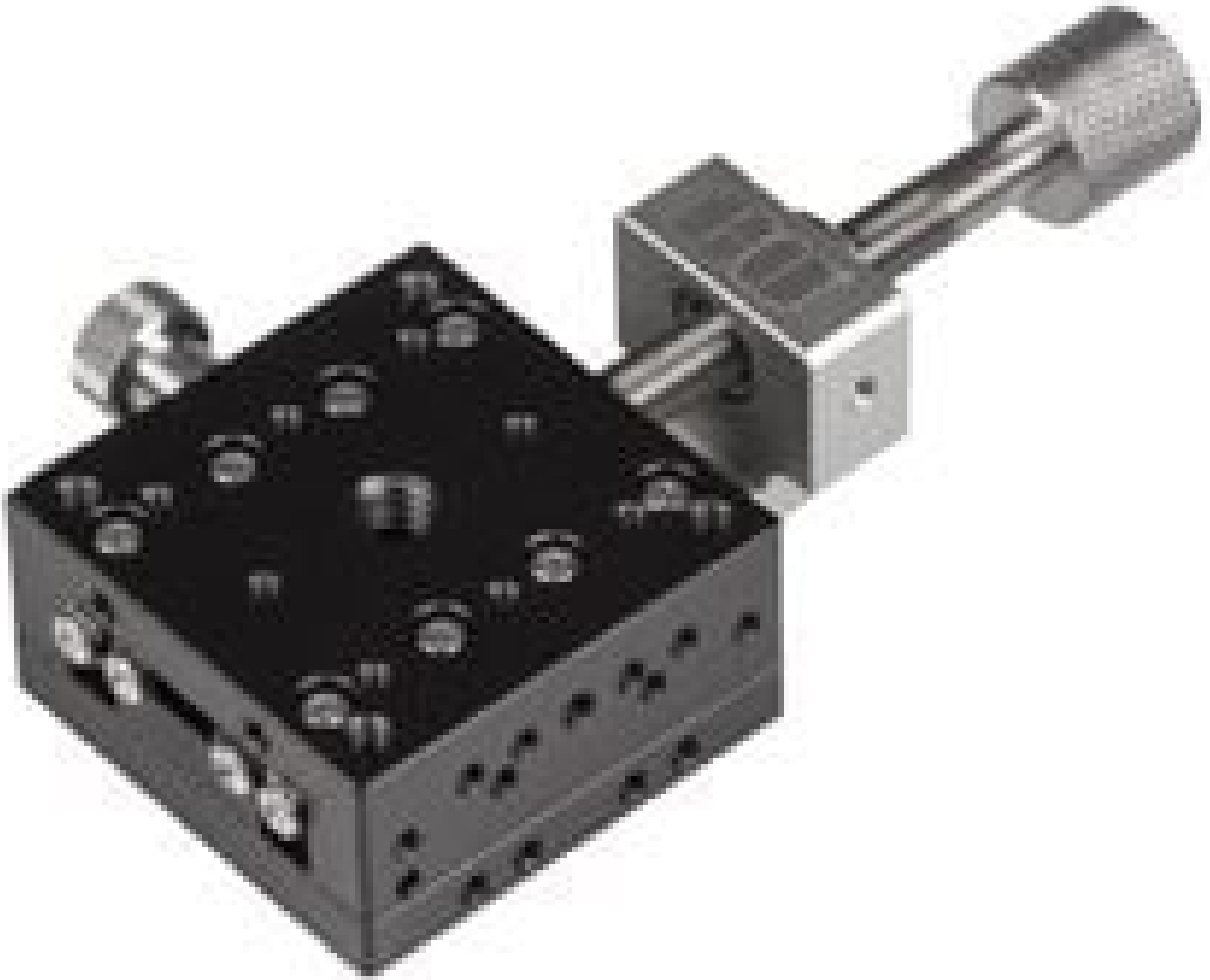
40mm, 0.5" Travel, Lead Screw Drive Stage (Center Drive)