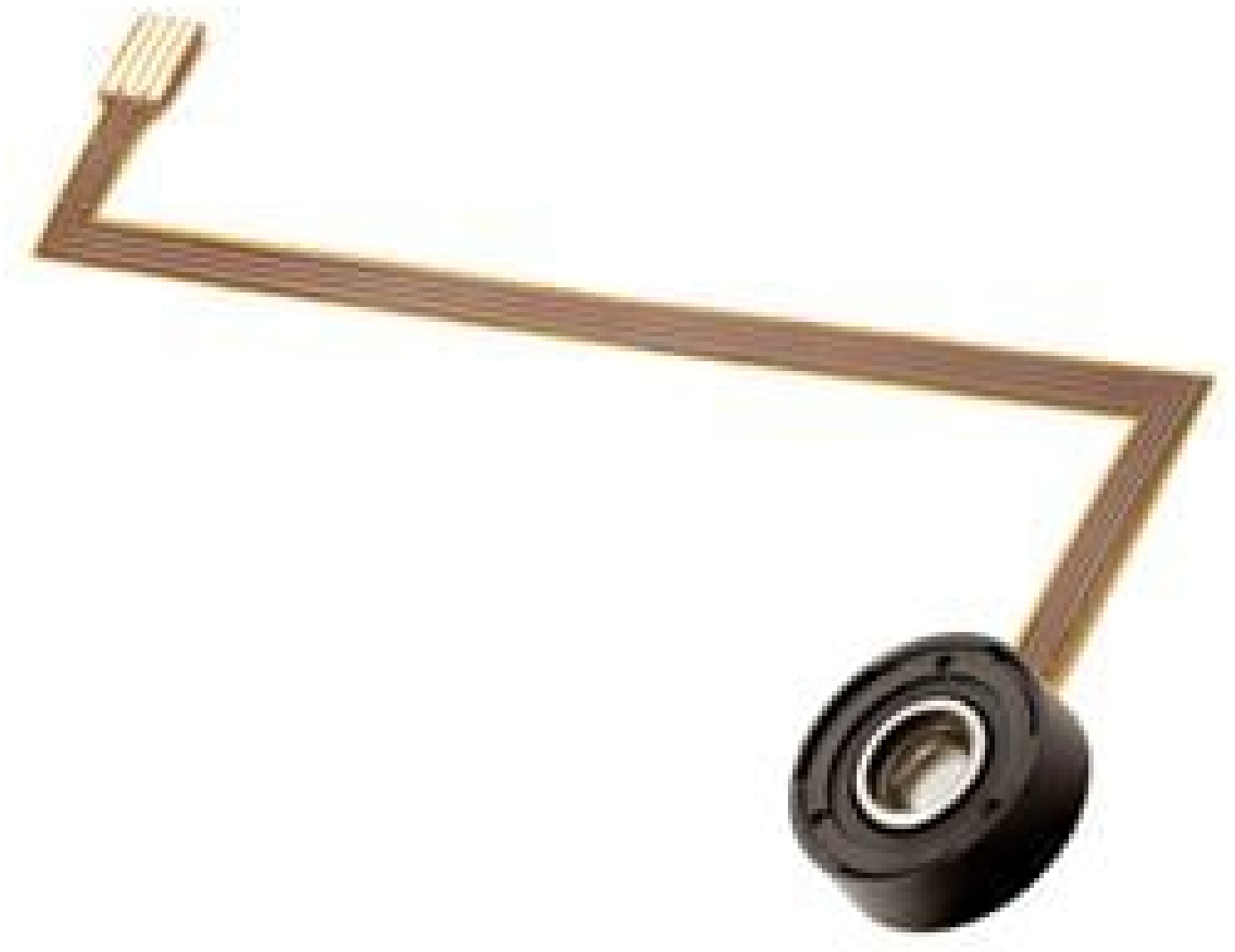
3.9mm CA, A-39N0-P04 Corning® Varioptic® Variable Focus Liquid Lens, Packaged A-Series