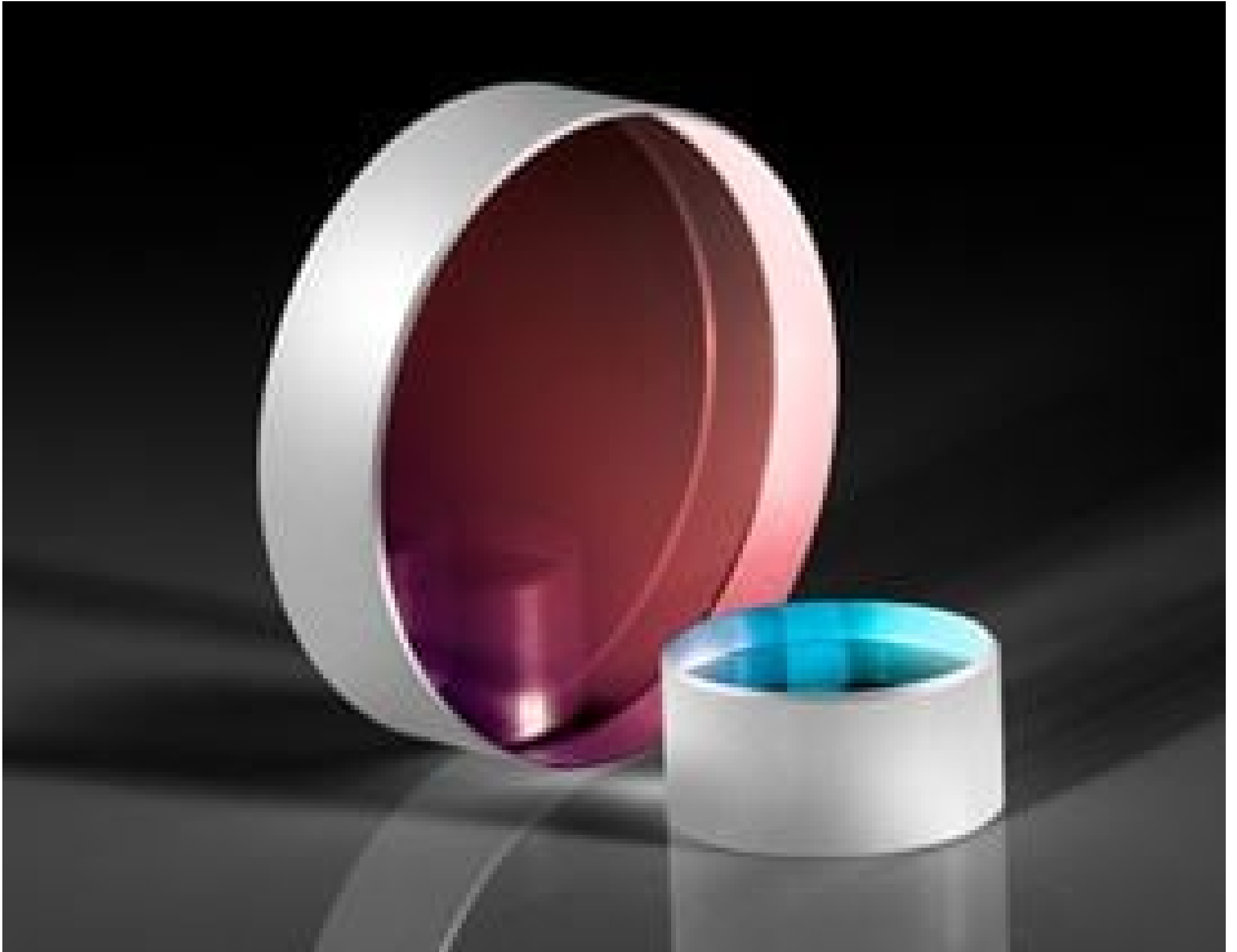
\lambda/10 Ultra-Low Reflectivity Windows