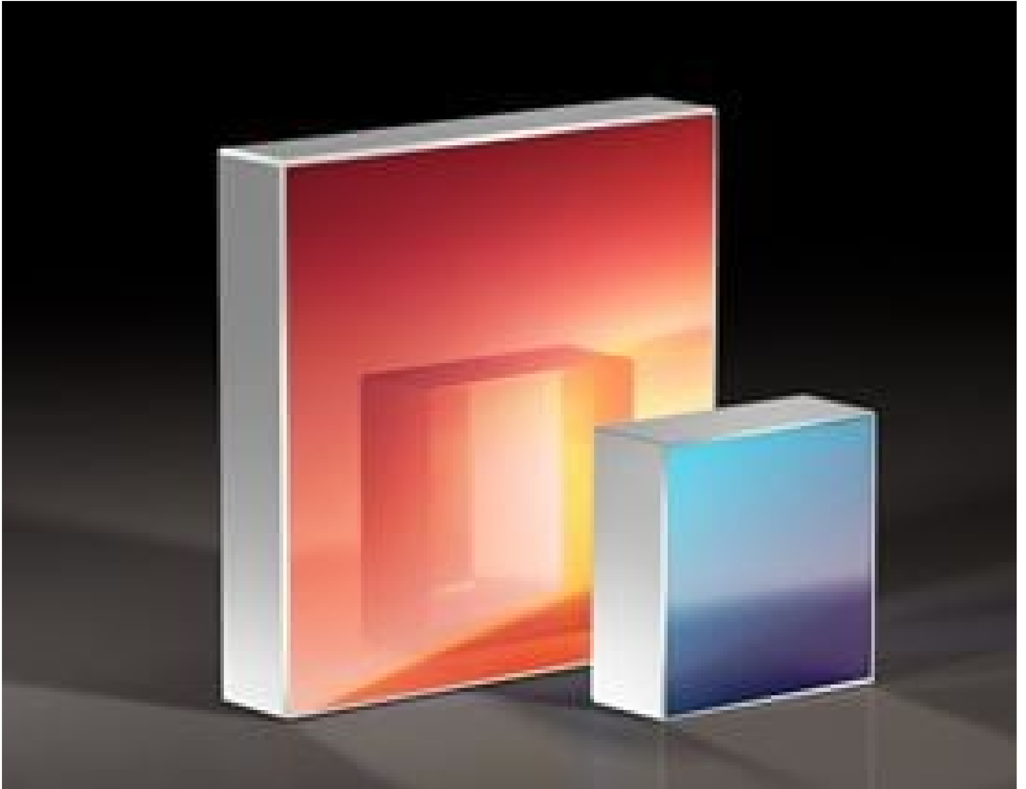
Reflective Holographic Gratings