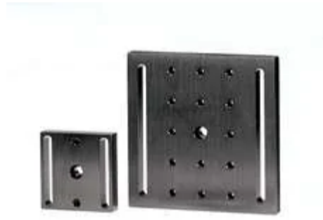
Metric/English and English/Metric Adapter Plates