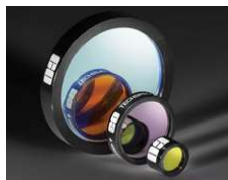
#65-656 - 656nm CWL, 10nm FWHM, 12.5mm Mounted Diameter ₹10,594