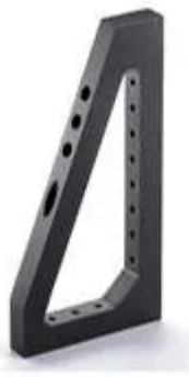
Universal Right Angle Brackets