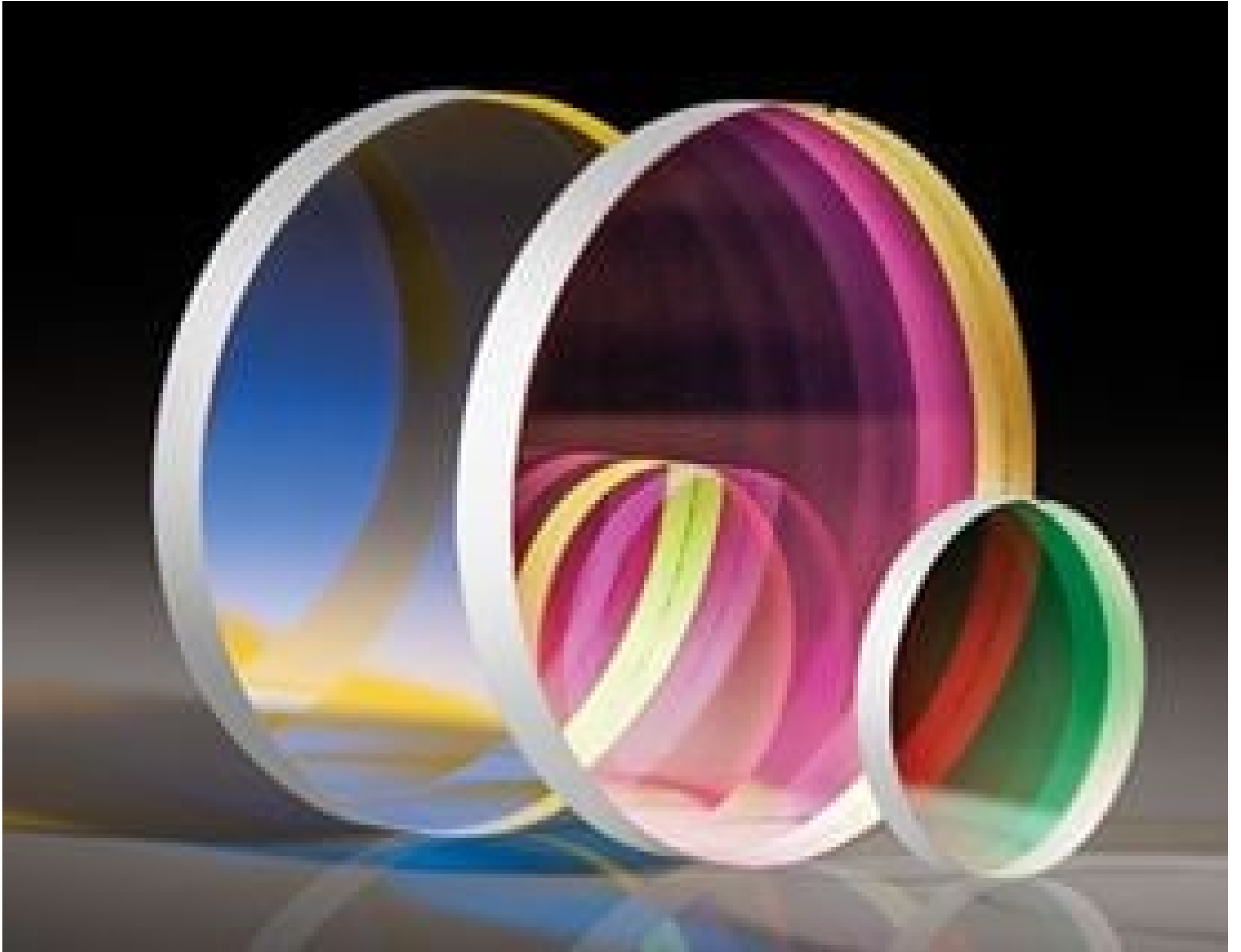
High Performance OD 4.0 Longpass Filters