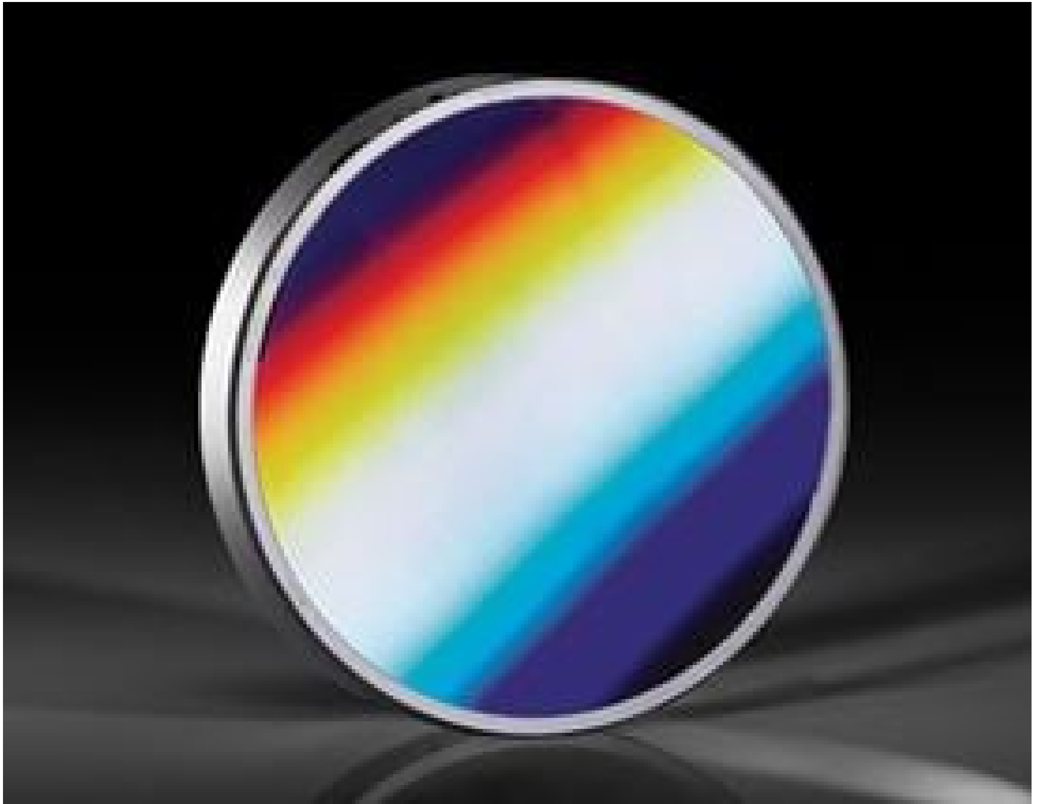
ZEISS Concave Diffraction Gratings