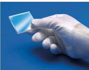
Component Handling Tools

These optics require special handling to avoid damage and ensure long-term performance. Proper handling, cleaning, and storage are essential to maintain optical quality. Explore our Optics Cleaning Resources for step-by-step guides and best practices. For personalized assistance, Email us or Chat with our technical support team.