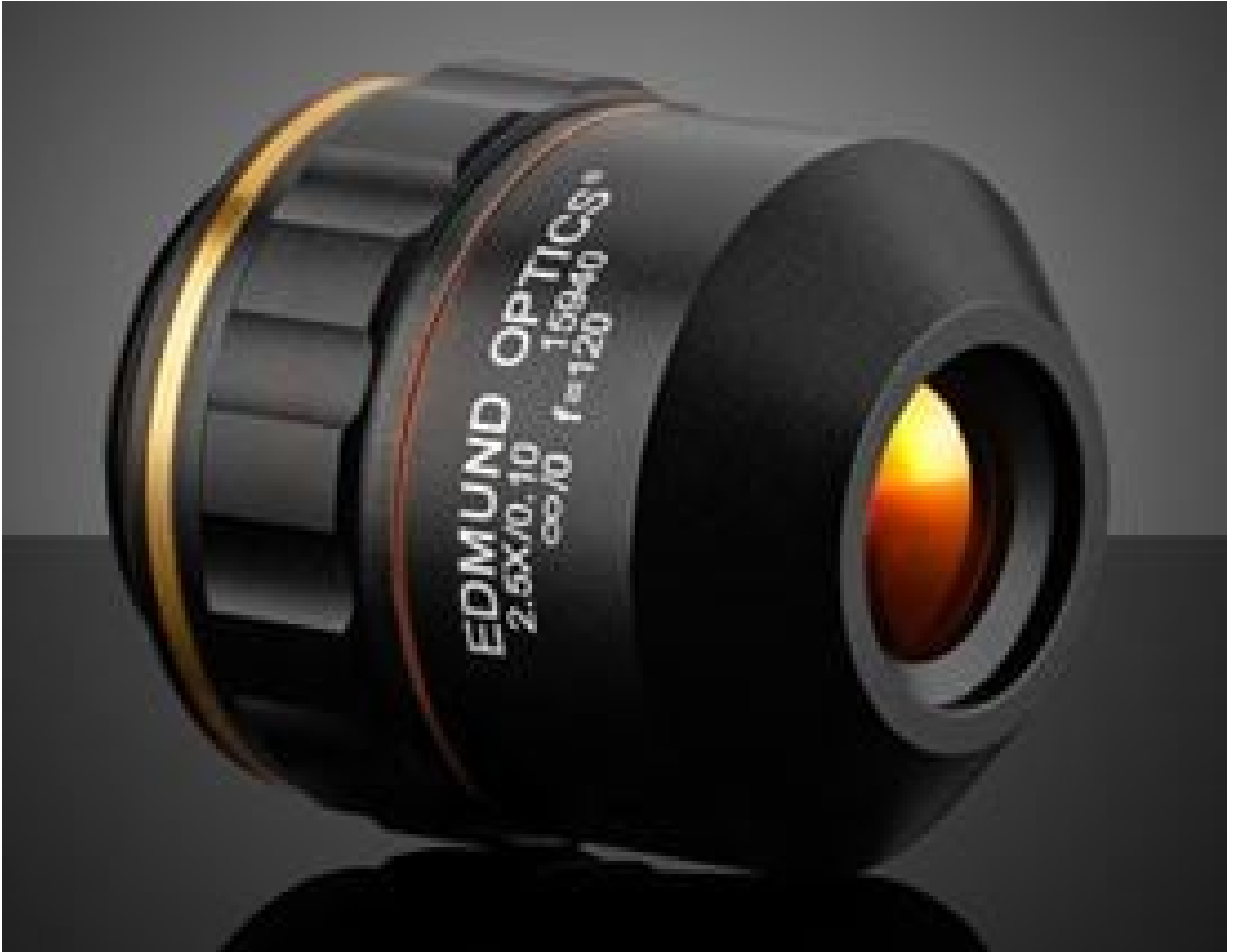
2.5X 120i Plan APO Infinity Corrected Objectives