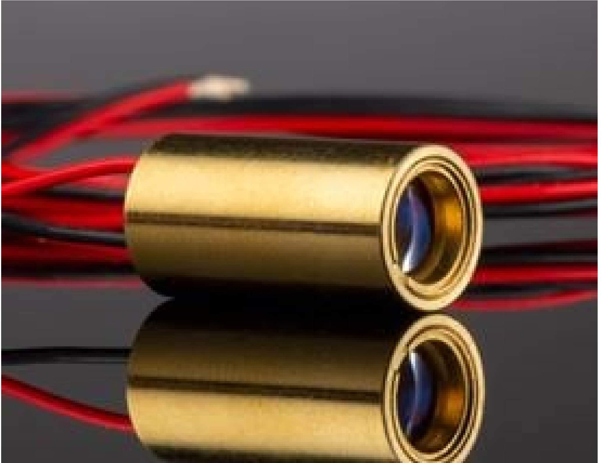
Coherent® Micro VLM™ Laser Diode