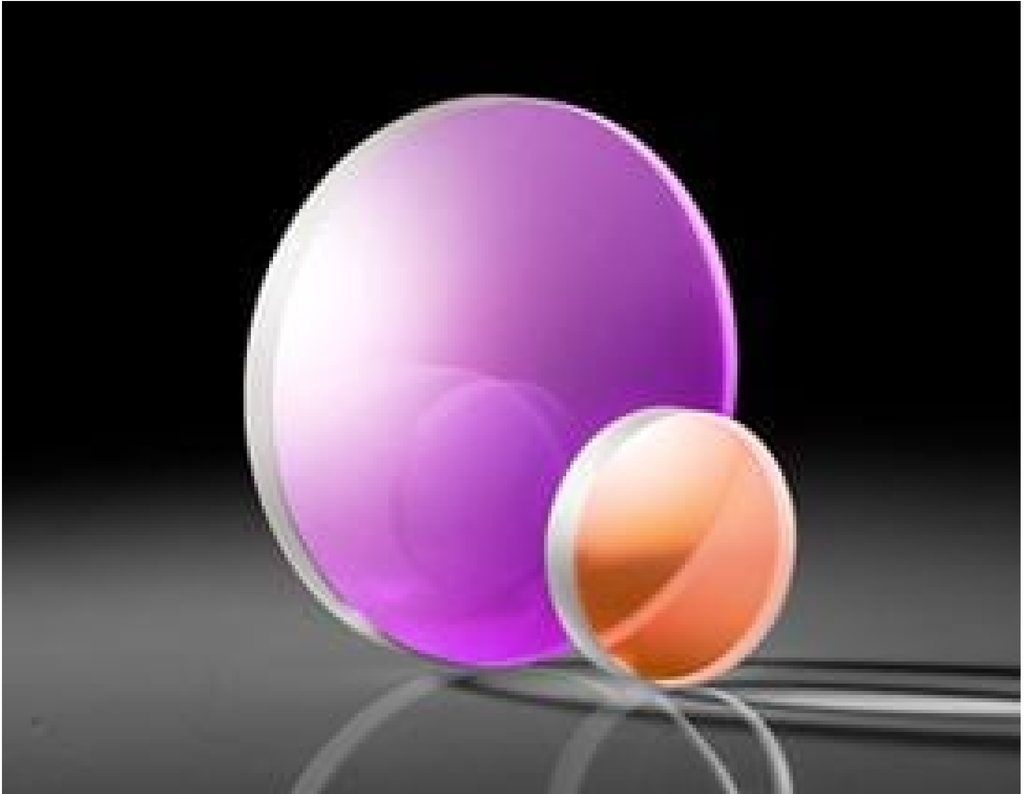
TECHSPEC Laser Grade PCXLenses