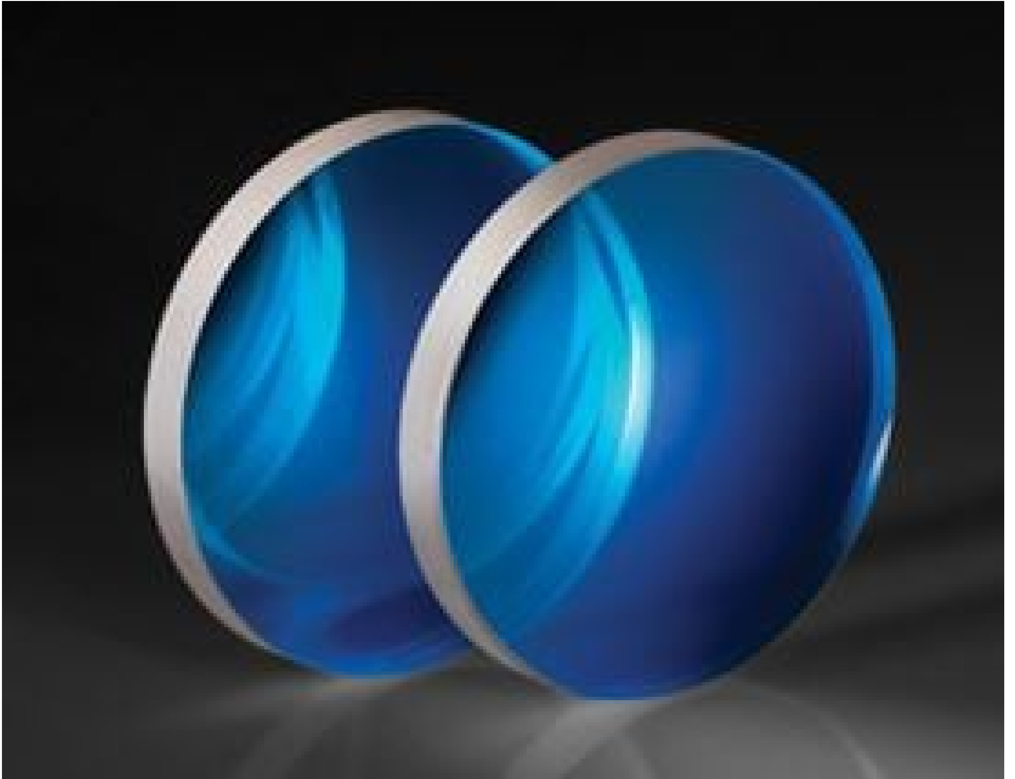
TECHSPEC® M10 Plate Beamsplitters