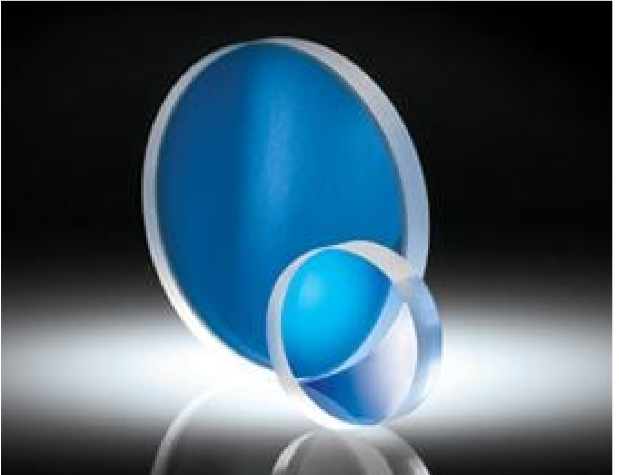
Spherical Aberration Compensation Plates