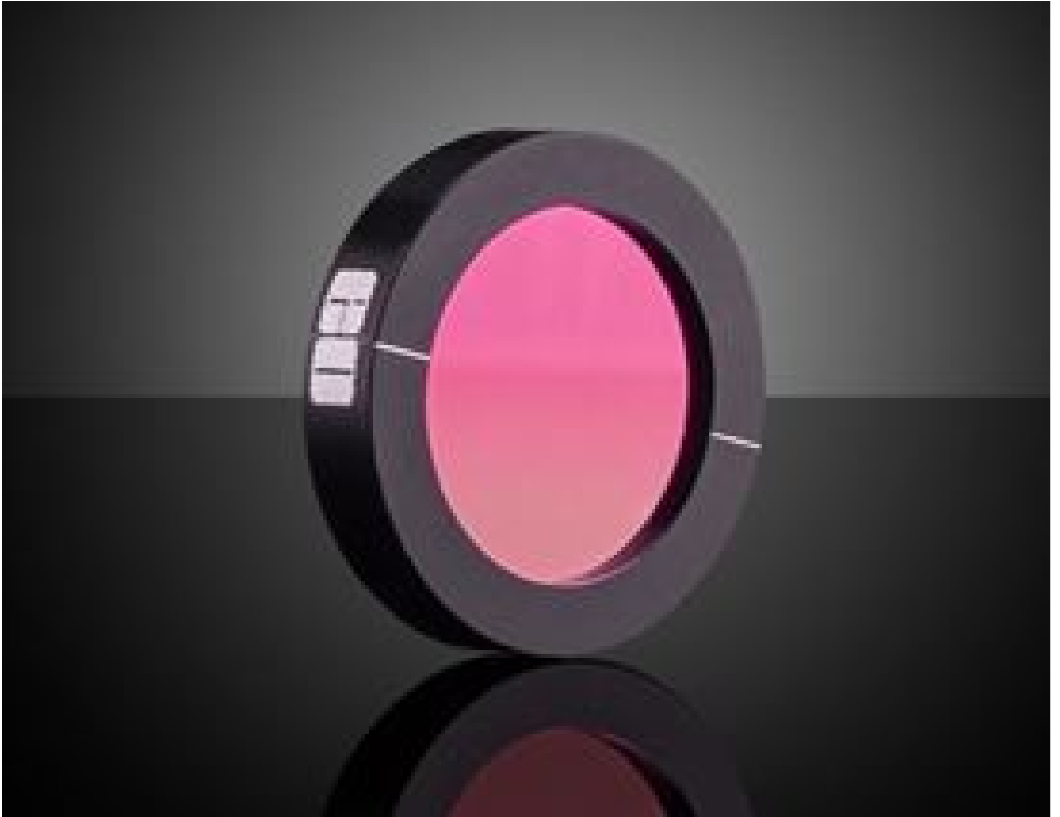
25mm Dia. ZnSe, IR Holographic Wire Grid Polarizer, #62-772