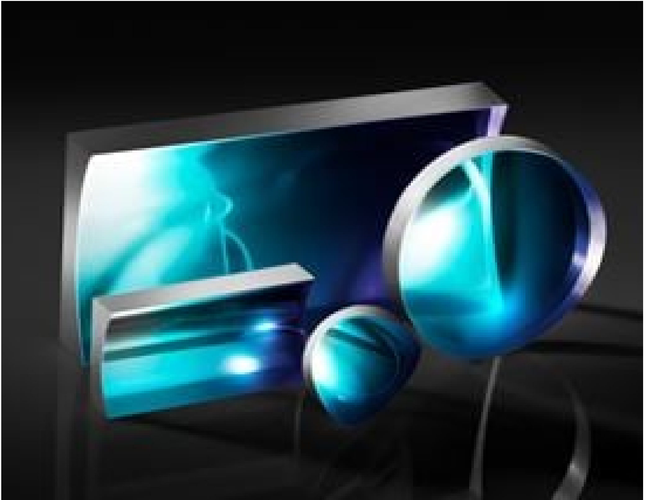
TECHSPEC® Illumination Grade PCV Cylinder Lenses