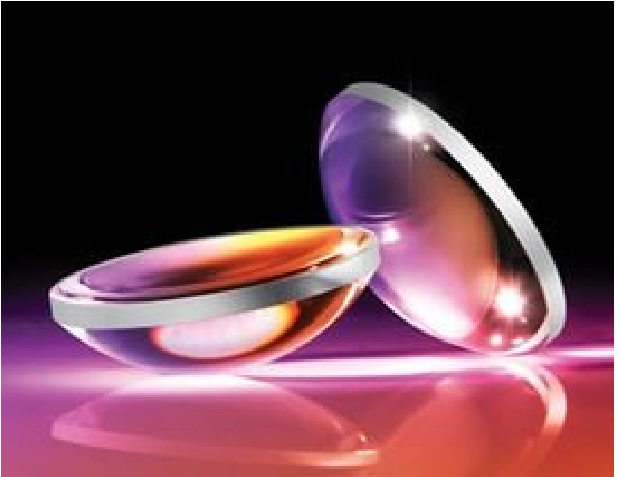
Hyperbolic Aspheric Lenses