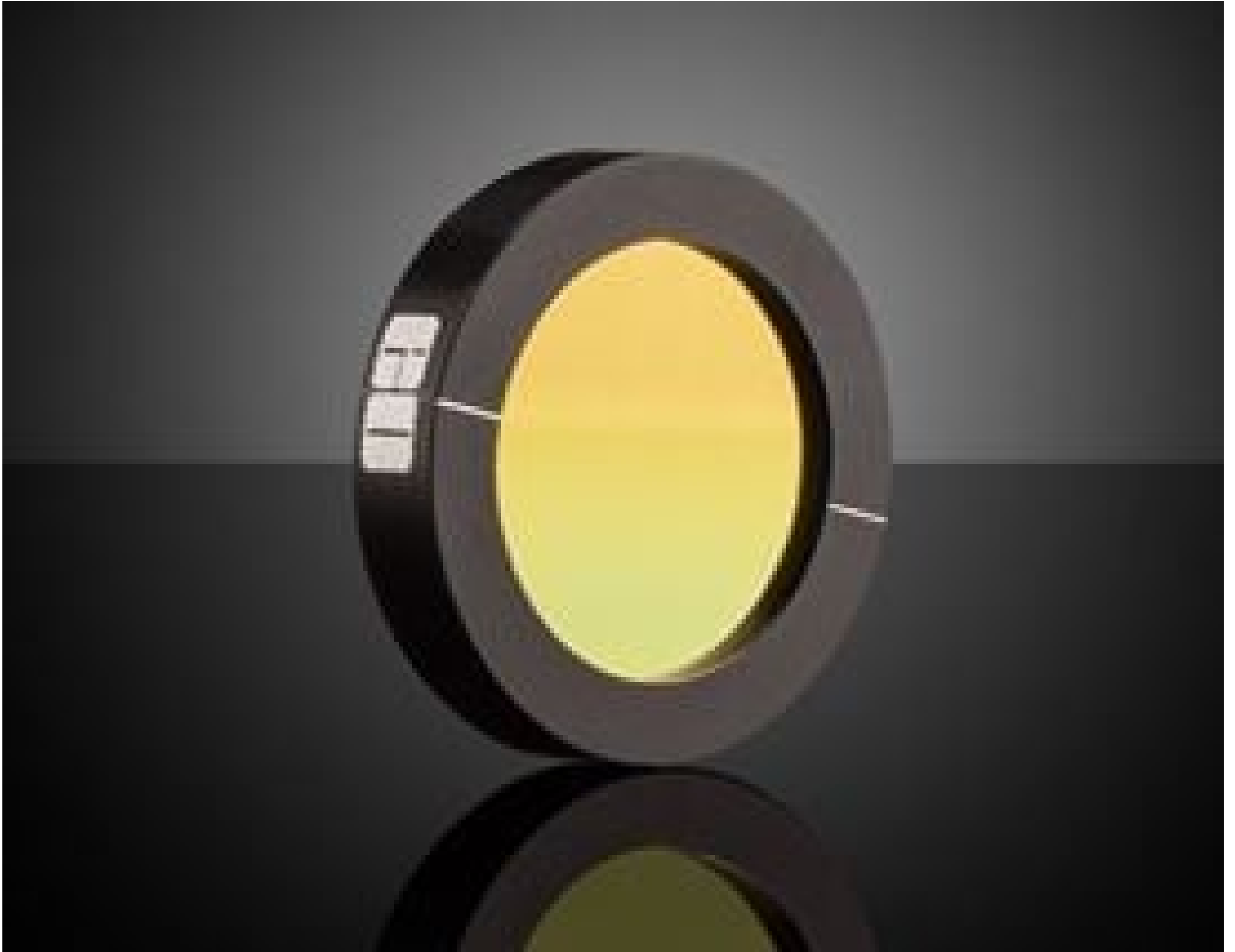
25mm Dia. BaF 2 , IR Holographic Wire Grid Polarizer, #62-770