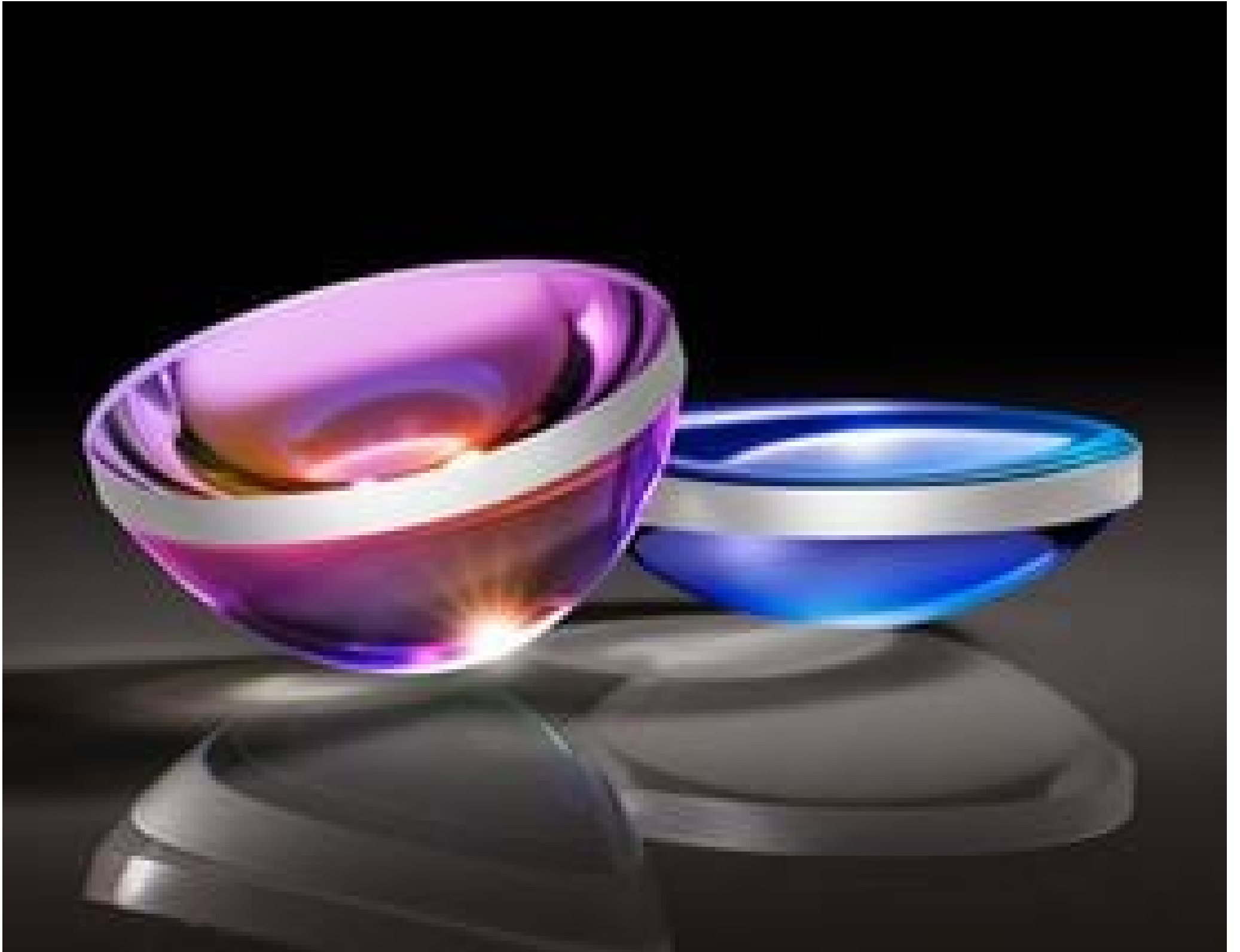
TECHSPEC UV Fused Silica Aspheric Lenses