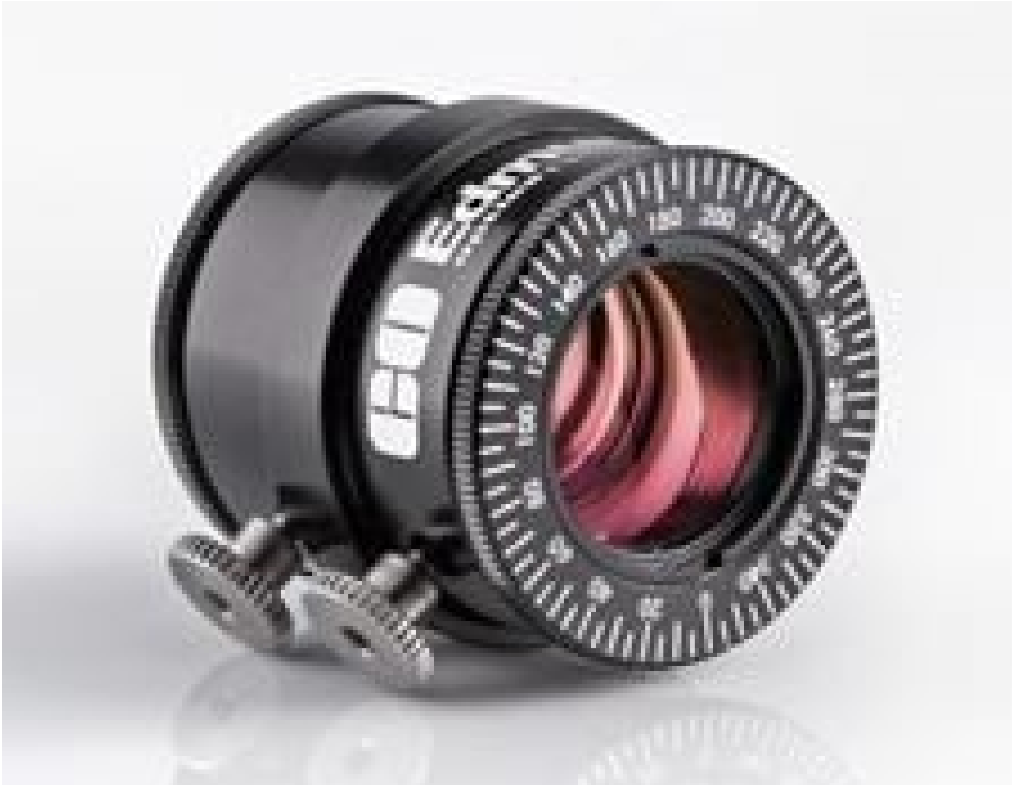
Risley Prism Mount, #33-431