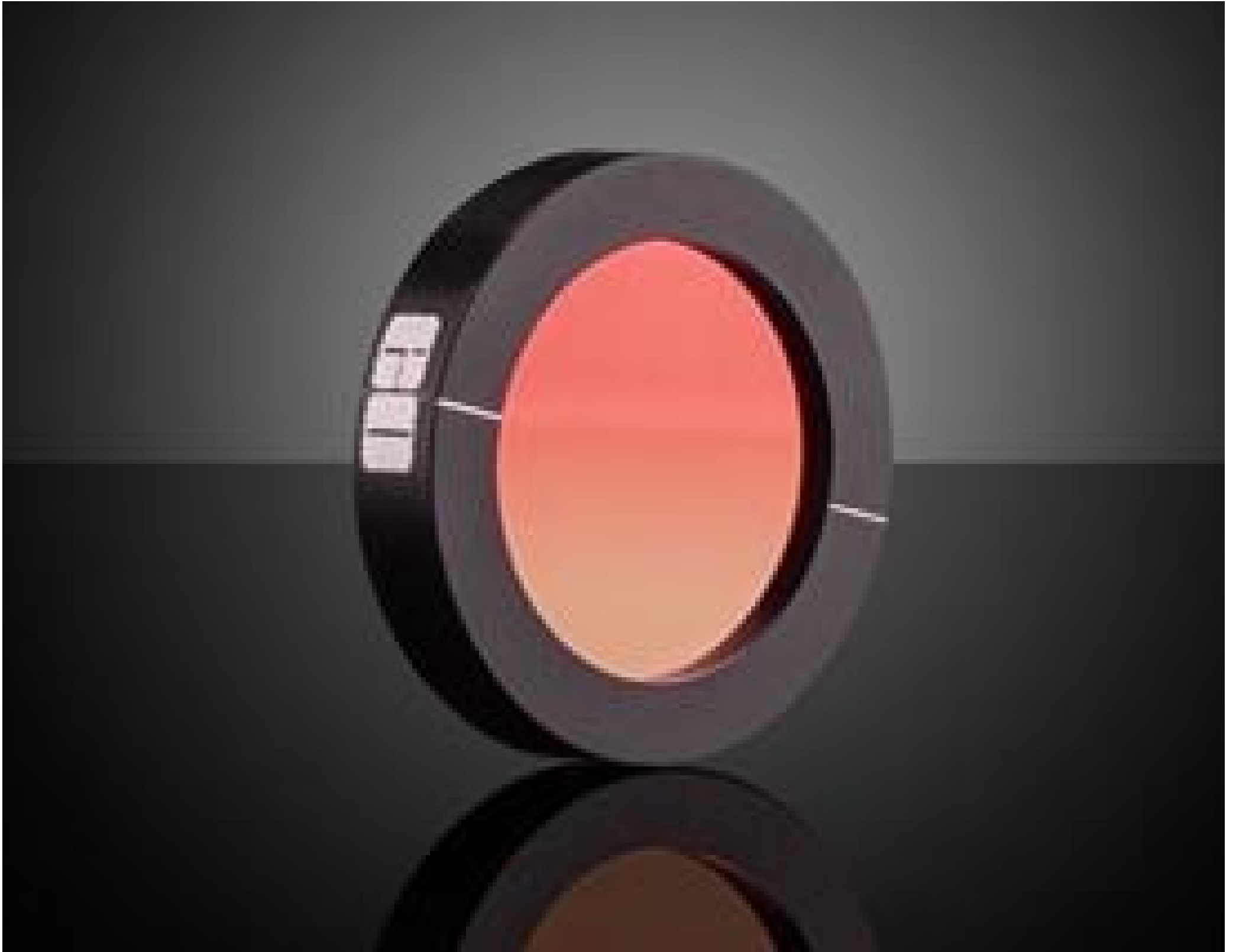
25mm Dia. Ge, IR Holographic Wire Grid Polarizer, #62-776