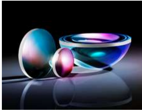
#32-477 - 25.0mm Dia. x 50.0mm FL Uncoated, Plano-Convex Lens ₹3,305