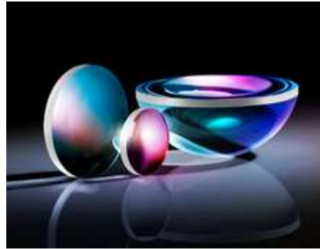
#32-479 - 25.0mm Dia. x 75.0mm FL Uncoated, Plano-Convex Lens ₹3,305