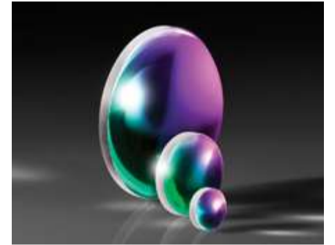
#34-162 - 25mm Dia. x 38mm FL 1550nm V-Coat, UV PCX Lens ₹18,262