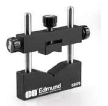
#03-676 - 7.0 - 40.0 Optic Height, English Bar-Type Optic Holder ₹10,694