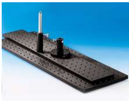
#03-641 - 36" x 4", Breadboard ₹29,056