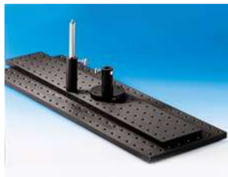
#03-642 - 36" x 8", Breadboard ₹40,760