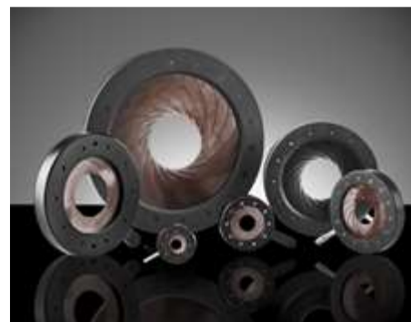
#03-671 - Ring Mount for #40-998 ₹5,045