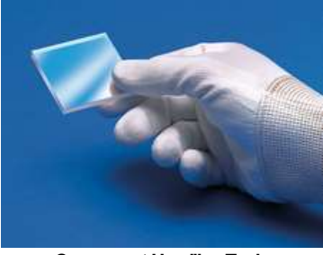
Component Handling Tools

These optics require special handling to avoid damage and ensure long-term performance. Proper handling, cleaning, and storage are essential to maintain optical quality. Explore our Optics Cleaning Resources for step-by-step guides and best practices. For personalized assistance, Email us or Chat with our technical support team.