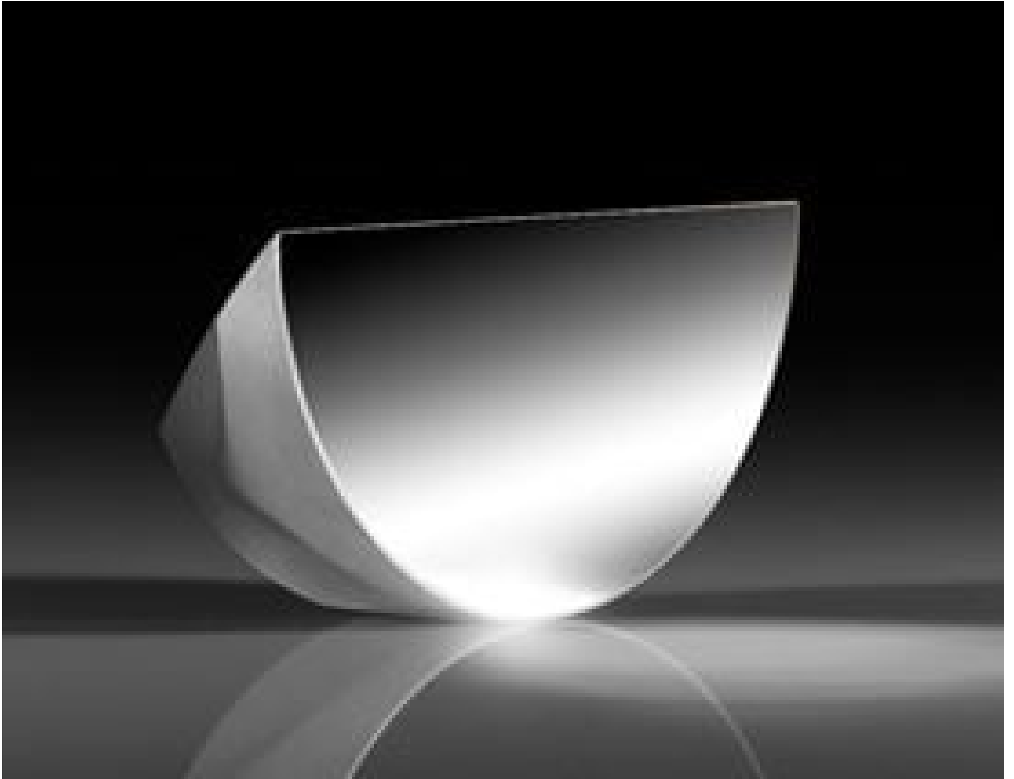
25.4mm Enhanced Protected Silver \lambda/10 D-Shaped Pickoff Mirror, #36-137