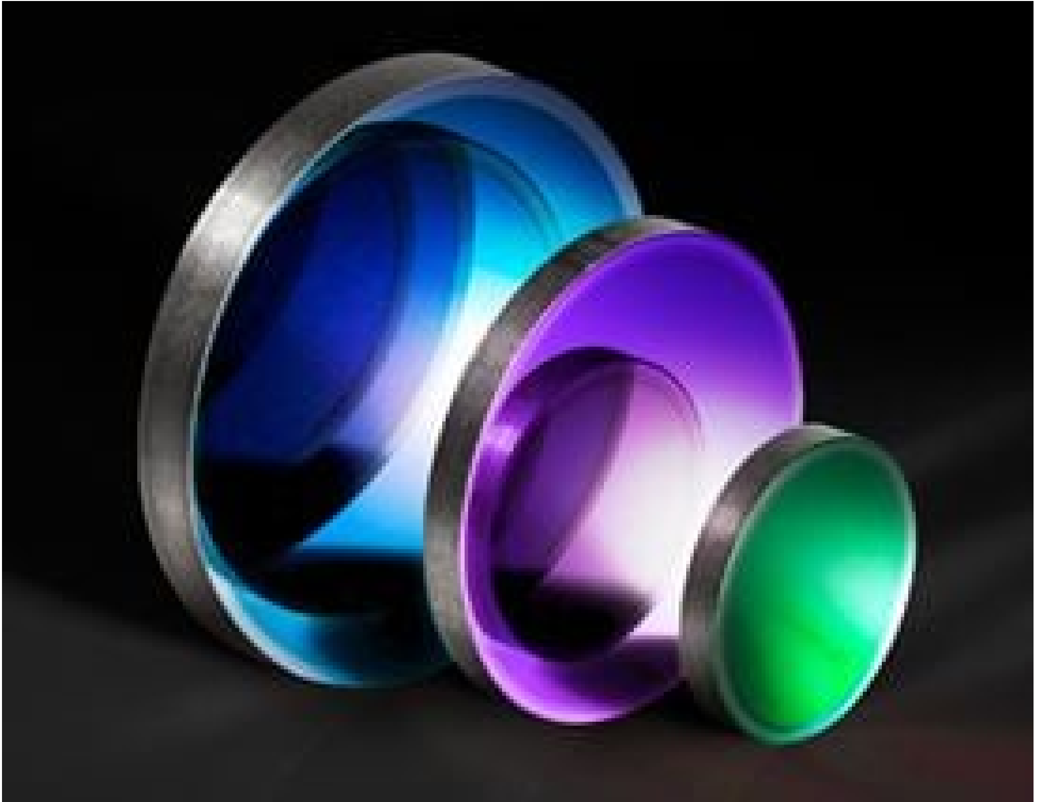
Germanium (Ge) Windows