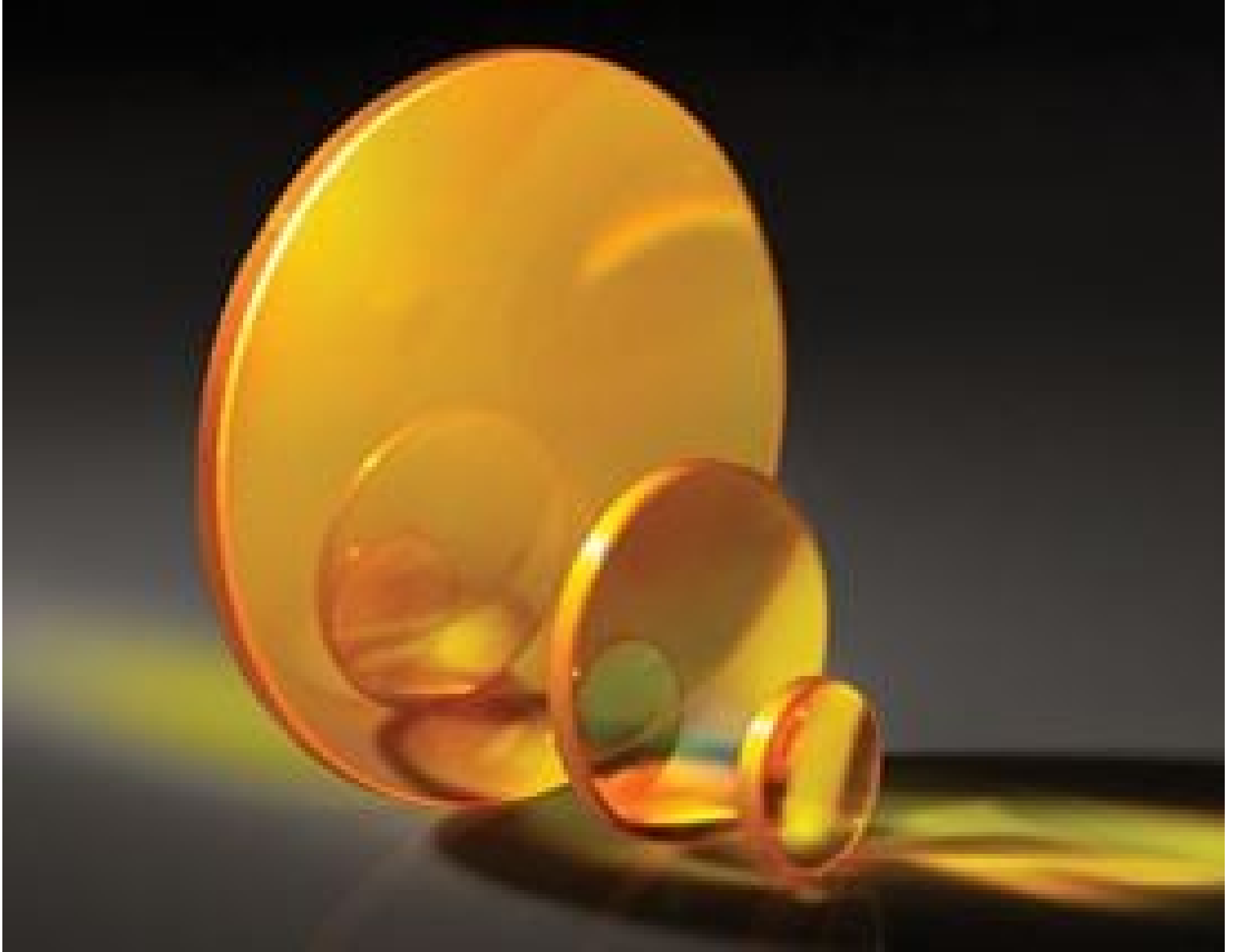
TECHSPEC Zinc Selenide (ZnSe) Plano-Convex (PCX) Lenses