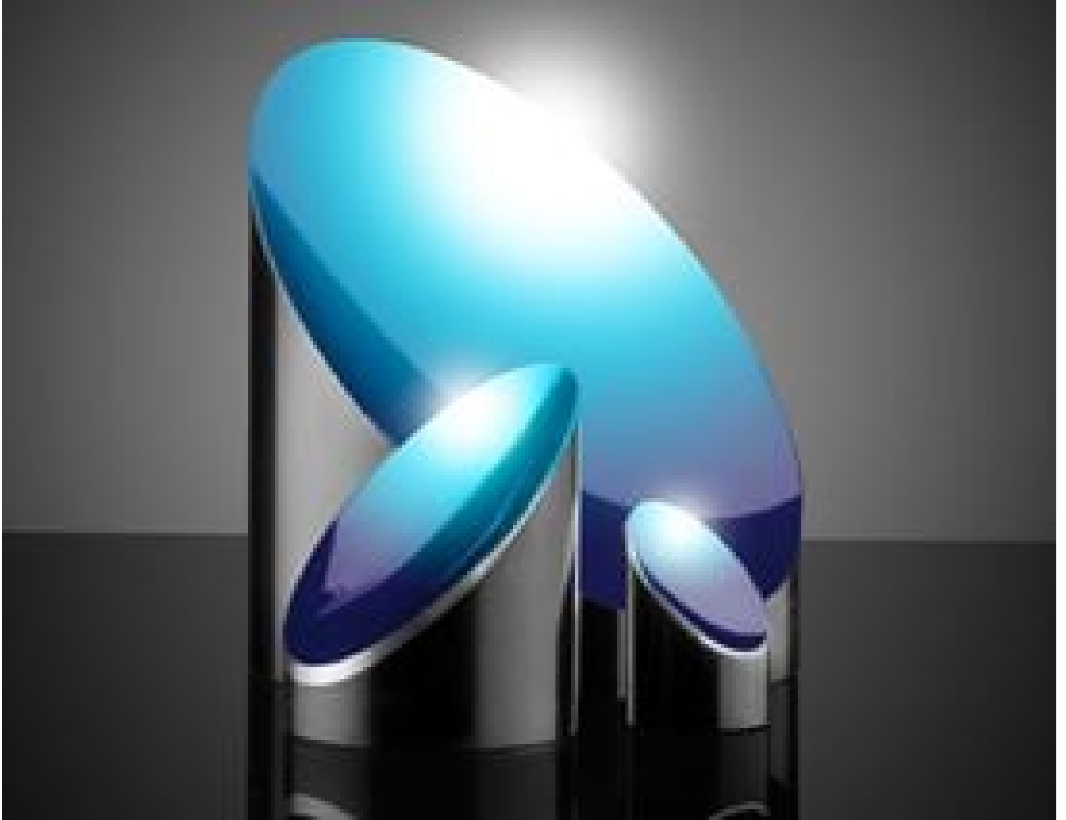
TECHSPEC® Ultrafast-Enhanced Silver Coated Off-Axis Parabolic (OAP) Mirrors