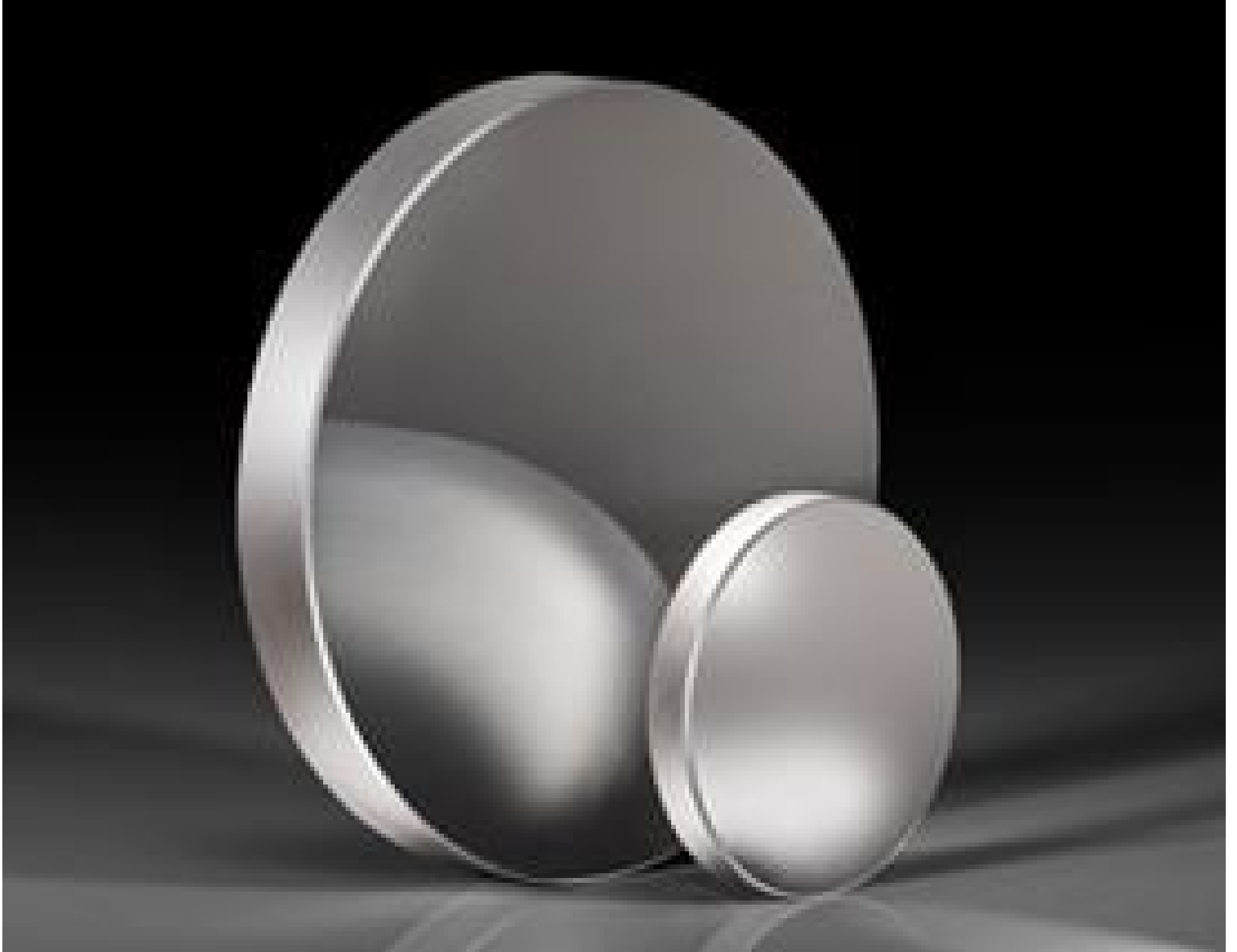
TECHSPEC® Ultrafast-Enhanced Silver Concave Laser Mirrors