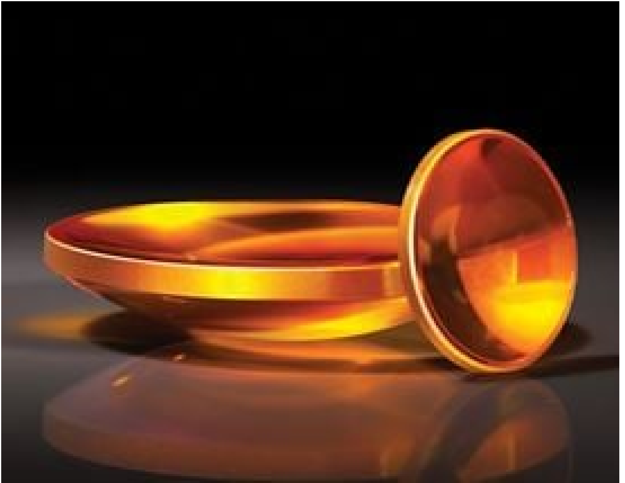
TECHSPEC Zinc Selenide (ZnSe) Aspheric Lenses