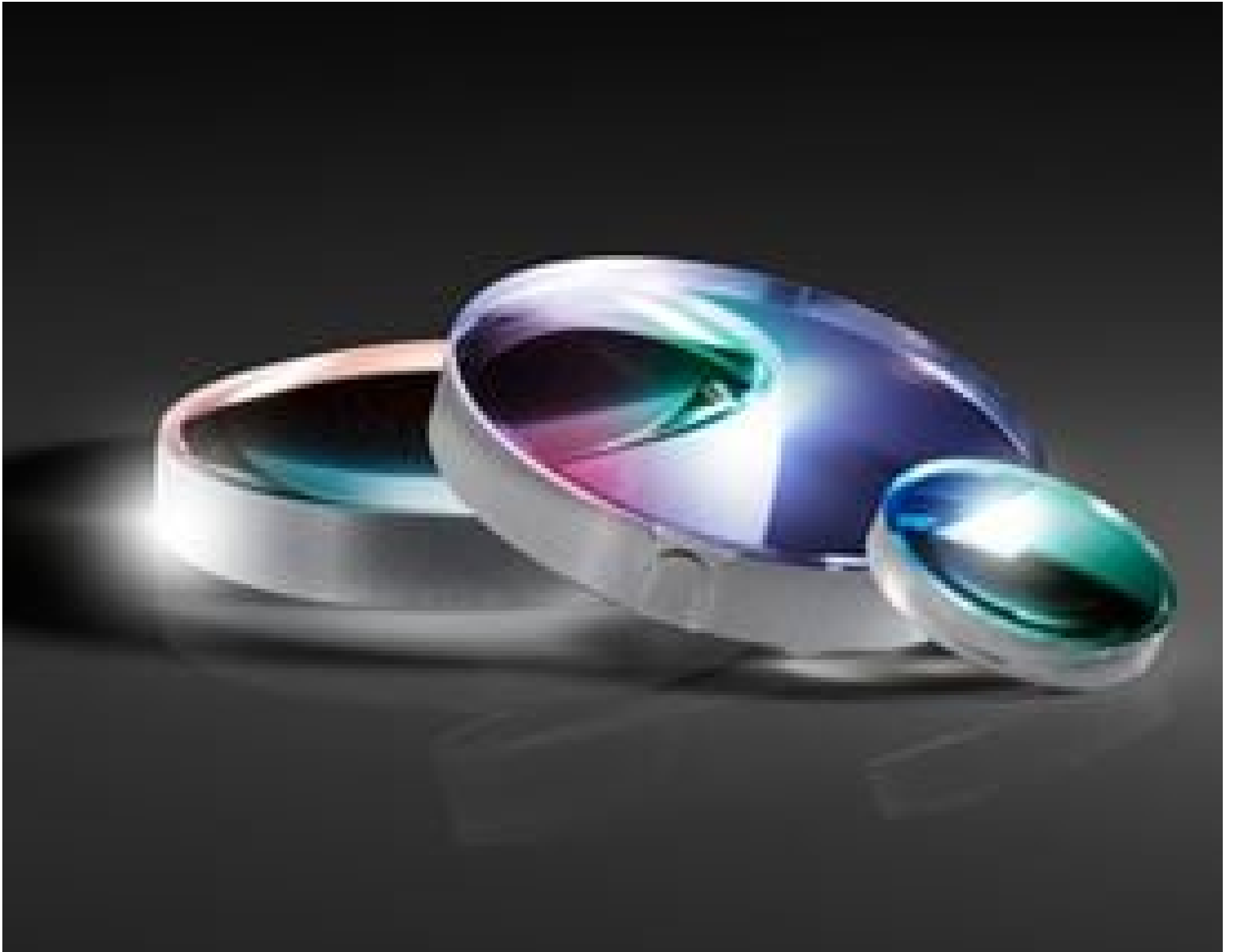
Molded Acrylic Aspheric Lenses