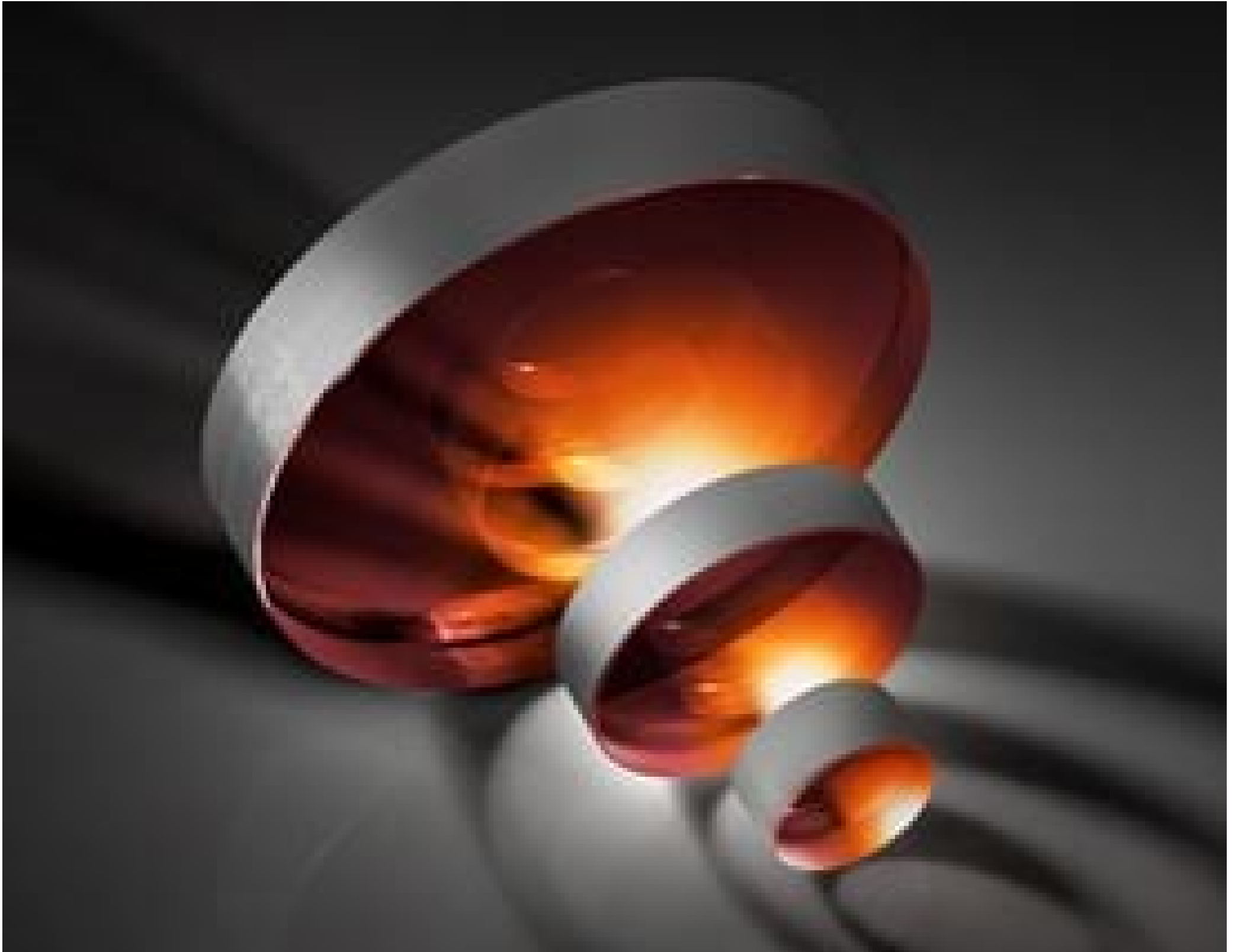
TECHSPEC® IBS Laser Line Windows