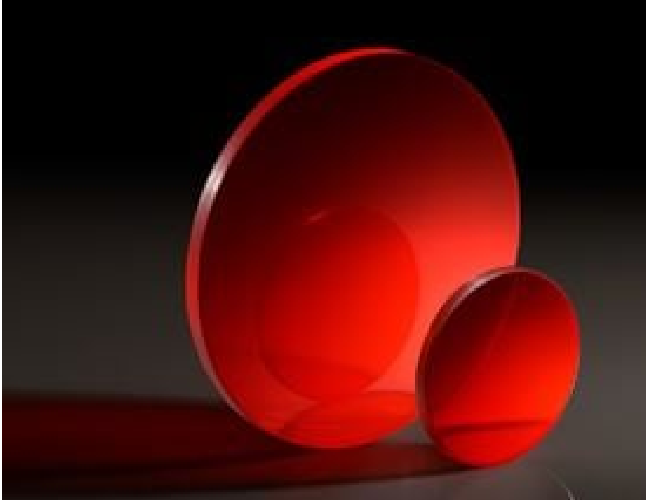
Thallium Bromiodide (KRS-5) Windows