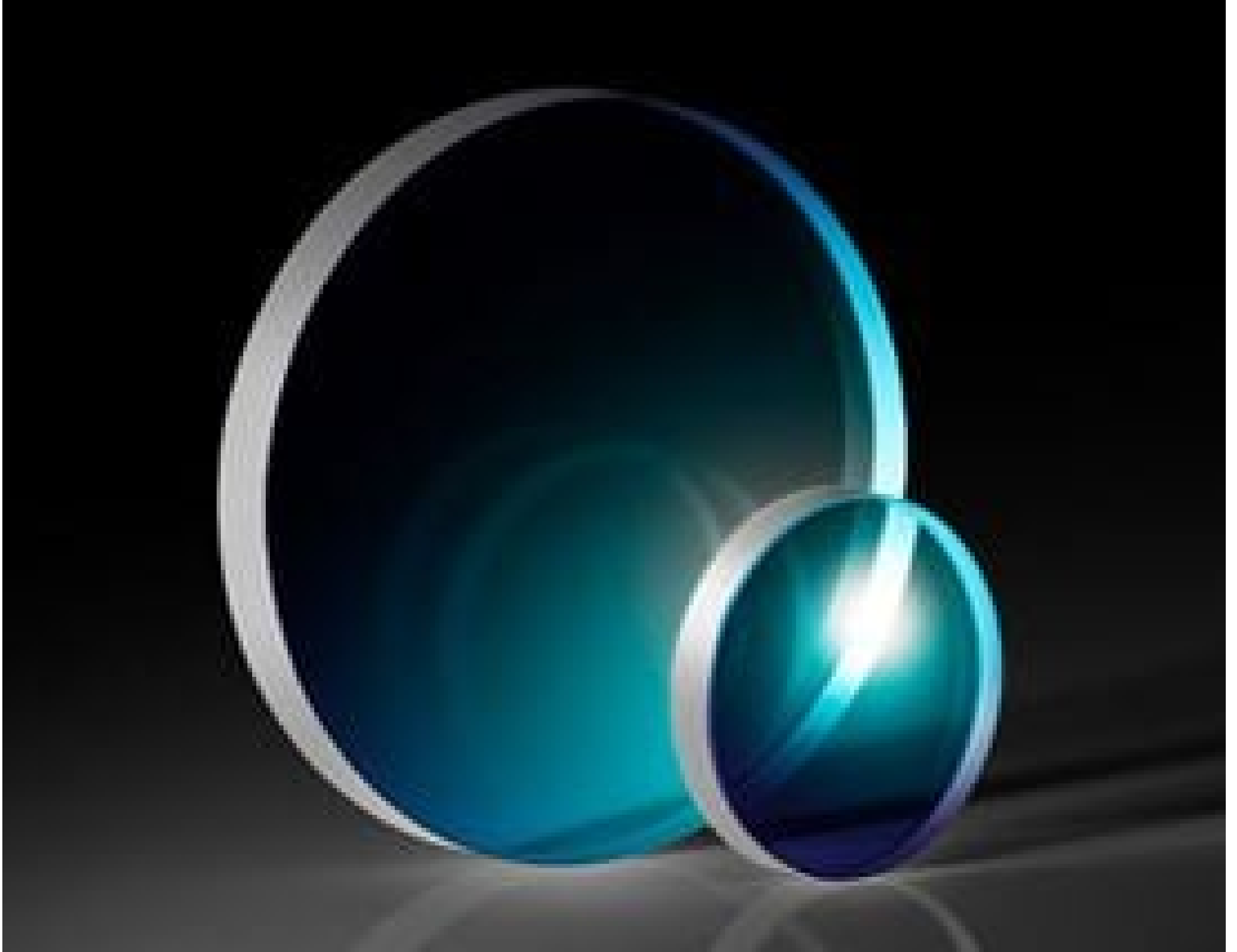
Barium Fluoride (BaF 2 ) Wedged Windows