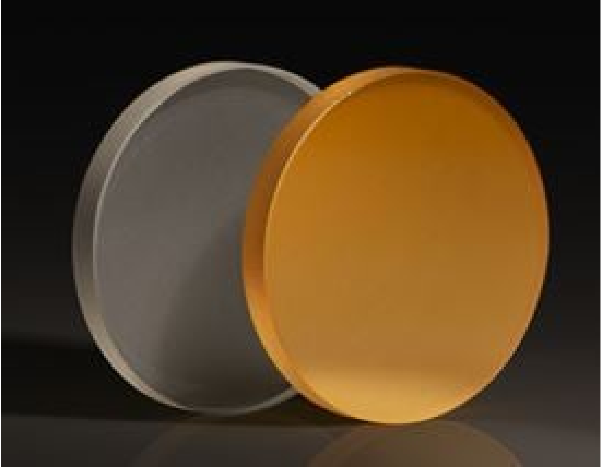
Infrared (IR) Diffusers