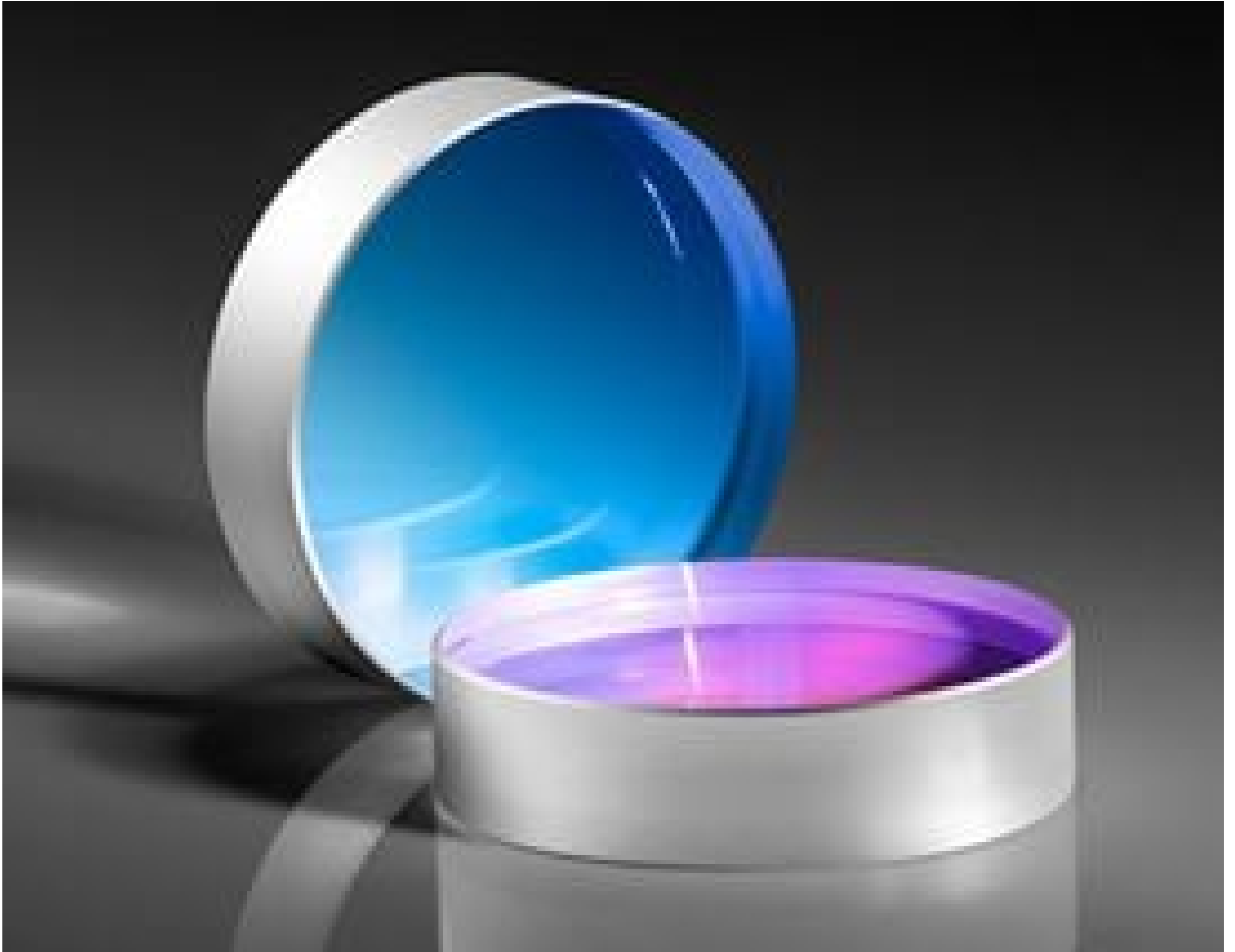
TECHSPEC® Nd:YAG Laser Line Beam Samplers