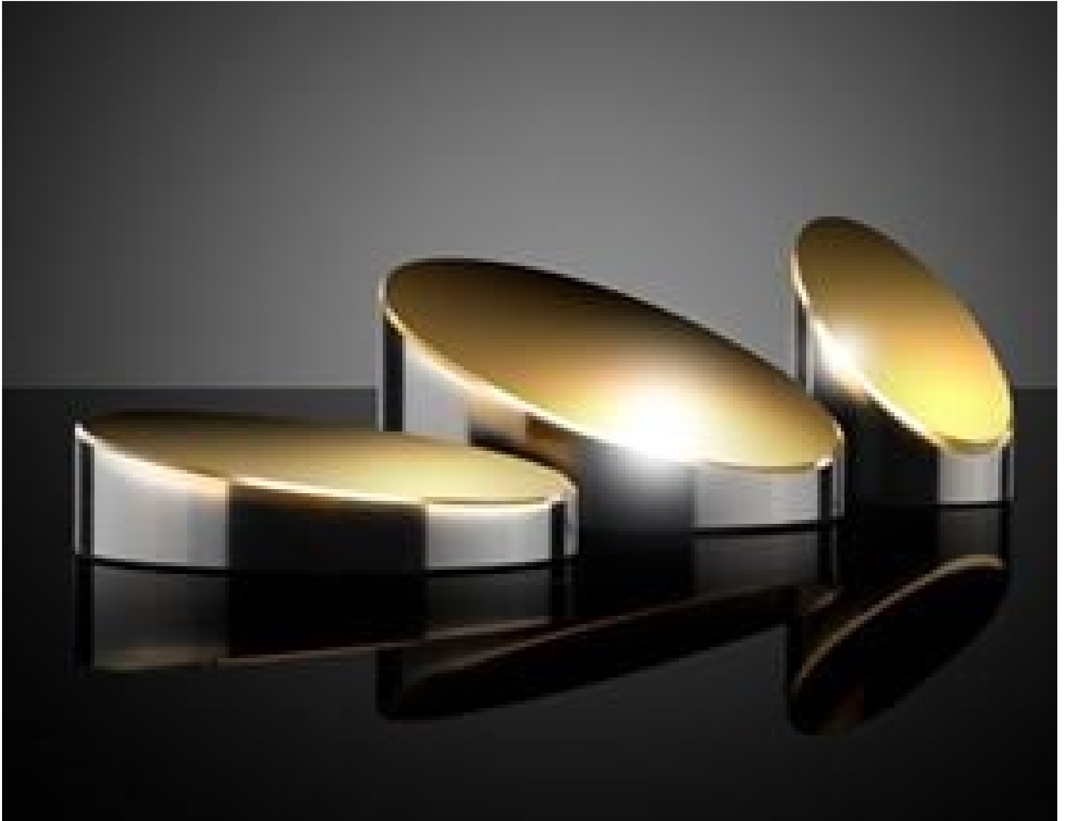
TECHSPEC Gold Off-Axis Parabolic Mirrors