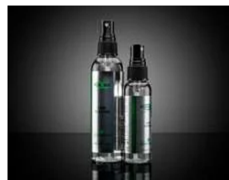
PUROSOL™ Optical Cleaner