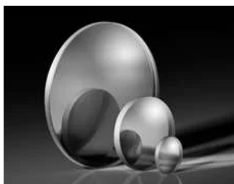
Rhodium Coated First Surface Mirrors