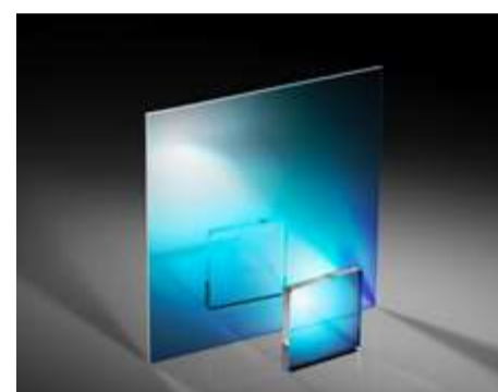
#31-436 - 25 x 38mm, 50R/50T, Plate Beamsplitter ₹6,357