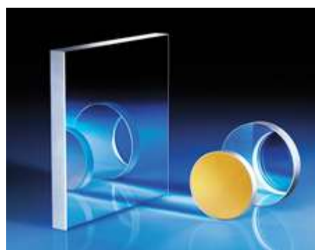
First Surface Mirrors