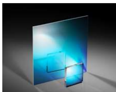
#31-413 - 20 x 37mm, 50R/50T, Plate Beamsplitter ₹5,701