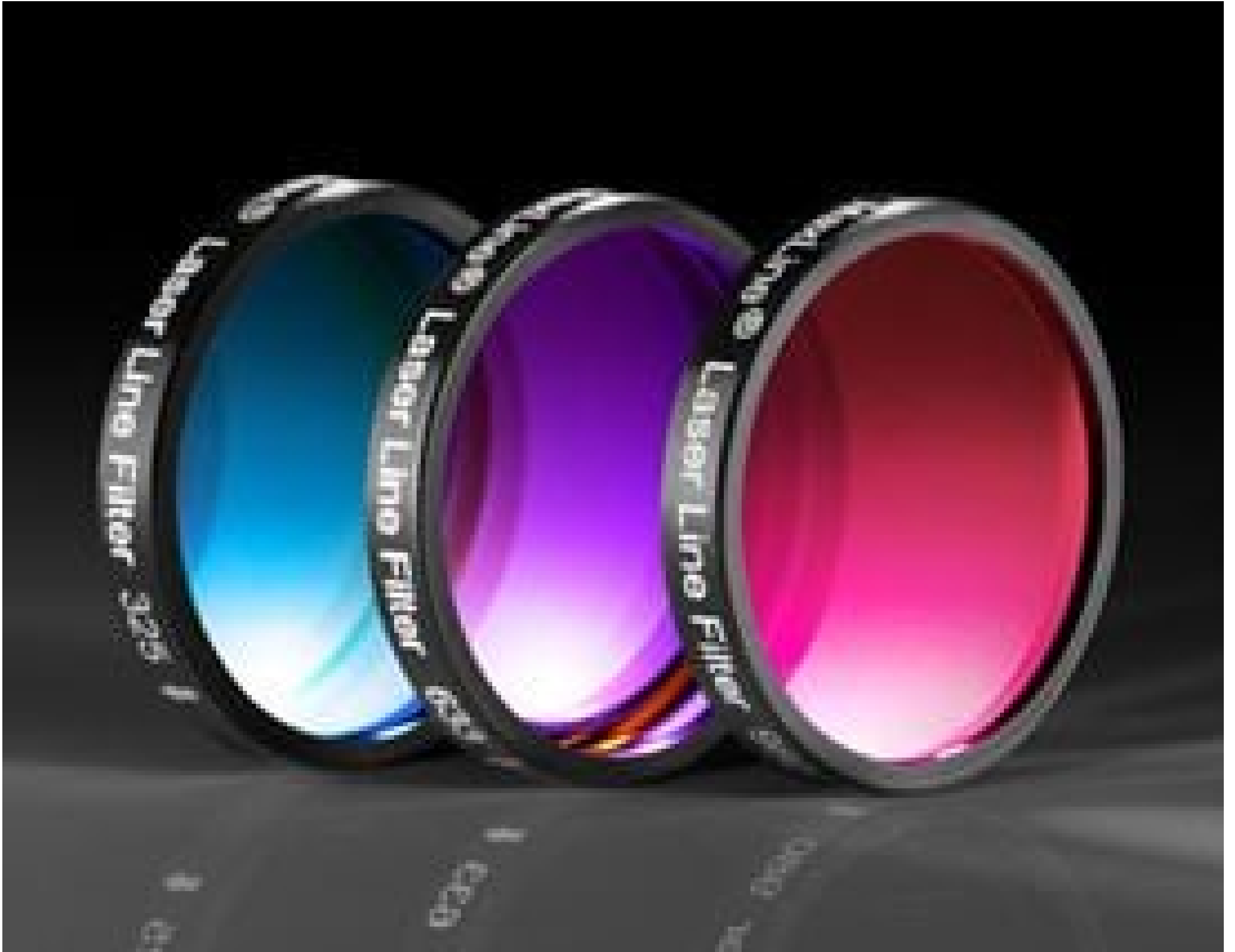
High Performance Laser Line Bandpass Filters