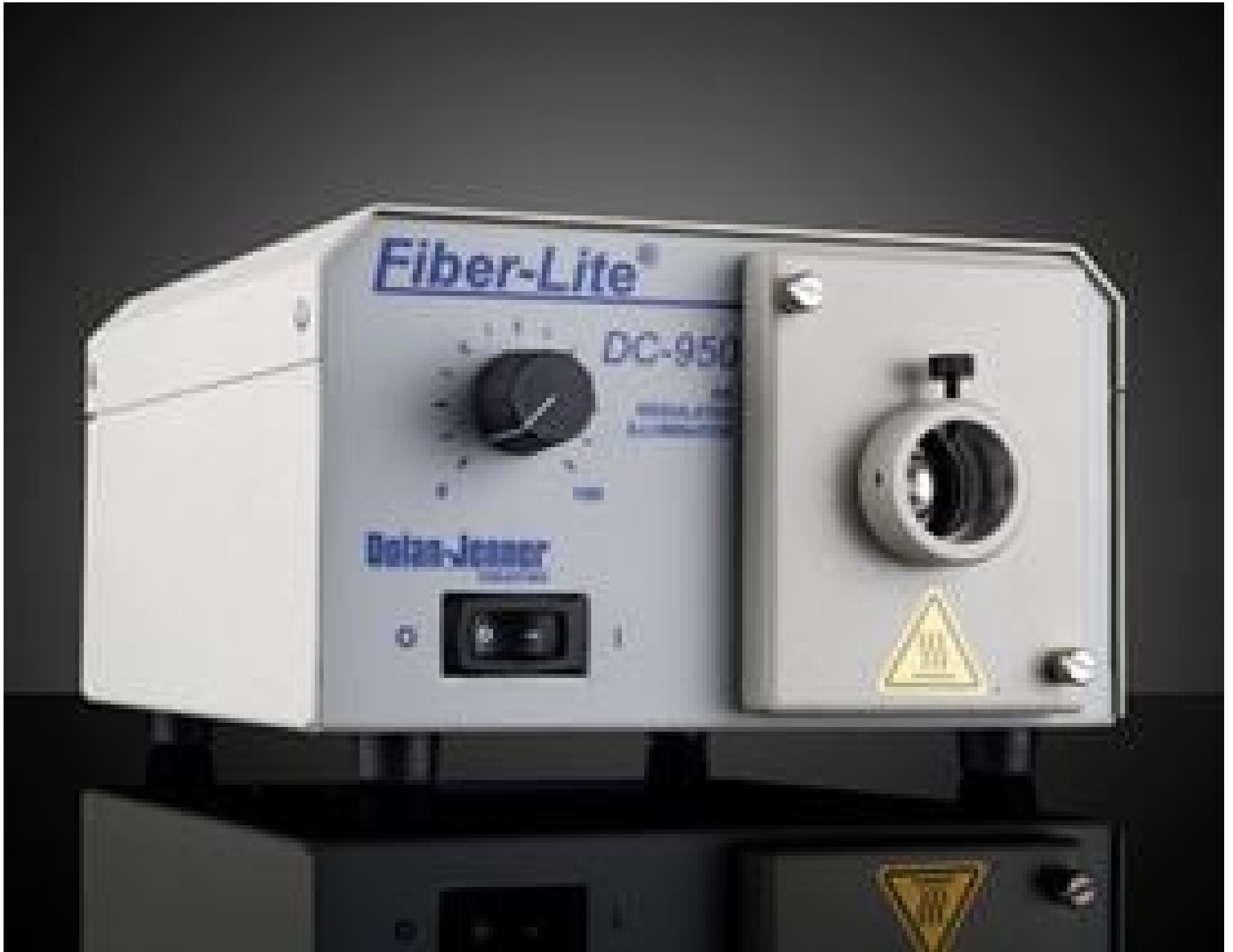
230V, with UK Cord, DC950HK Illuminator, #62-006