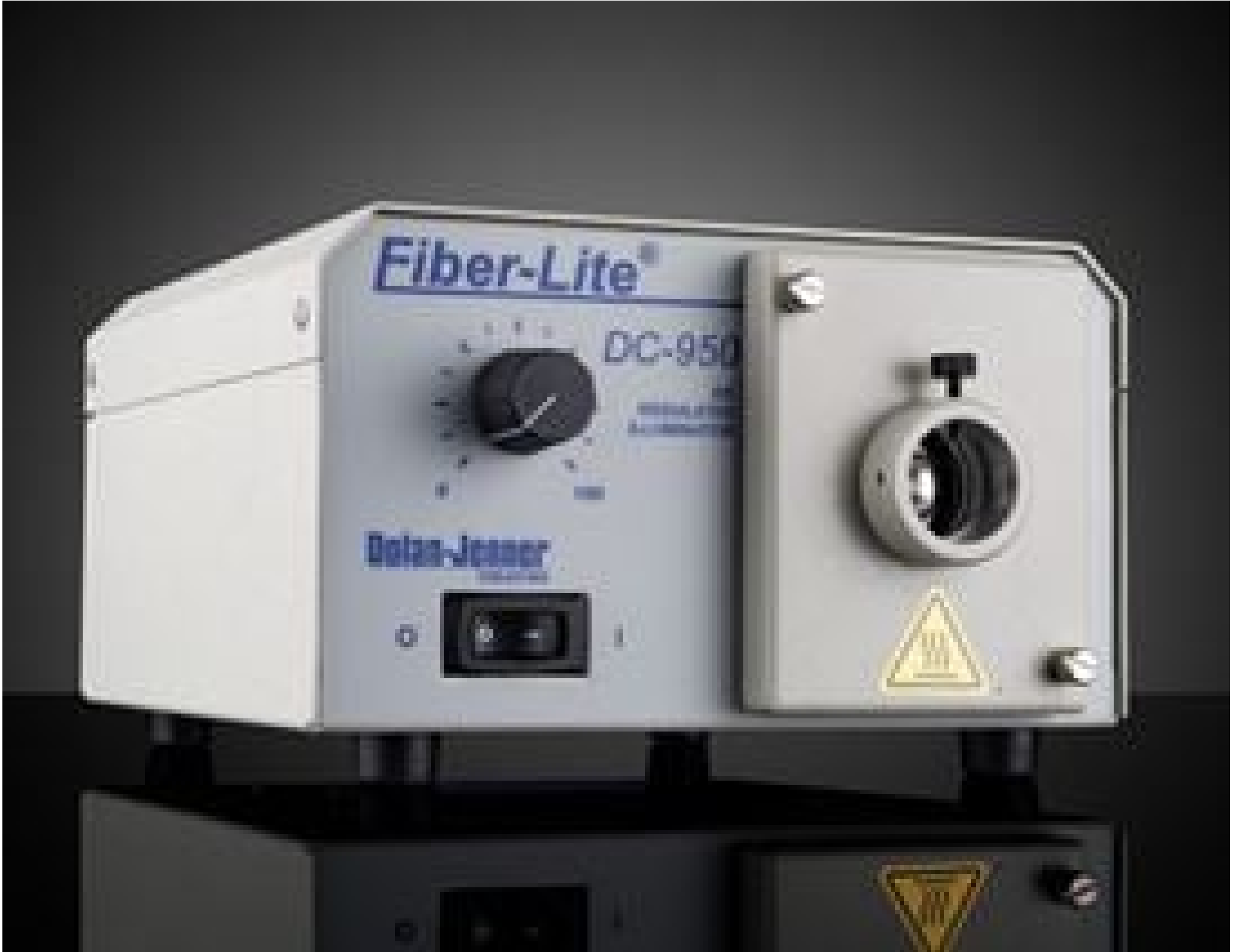
230V, with UK Cord, DC950HK Illuminator, #62-006