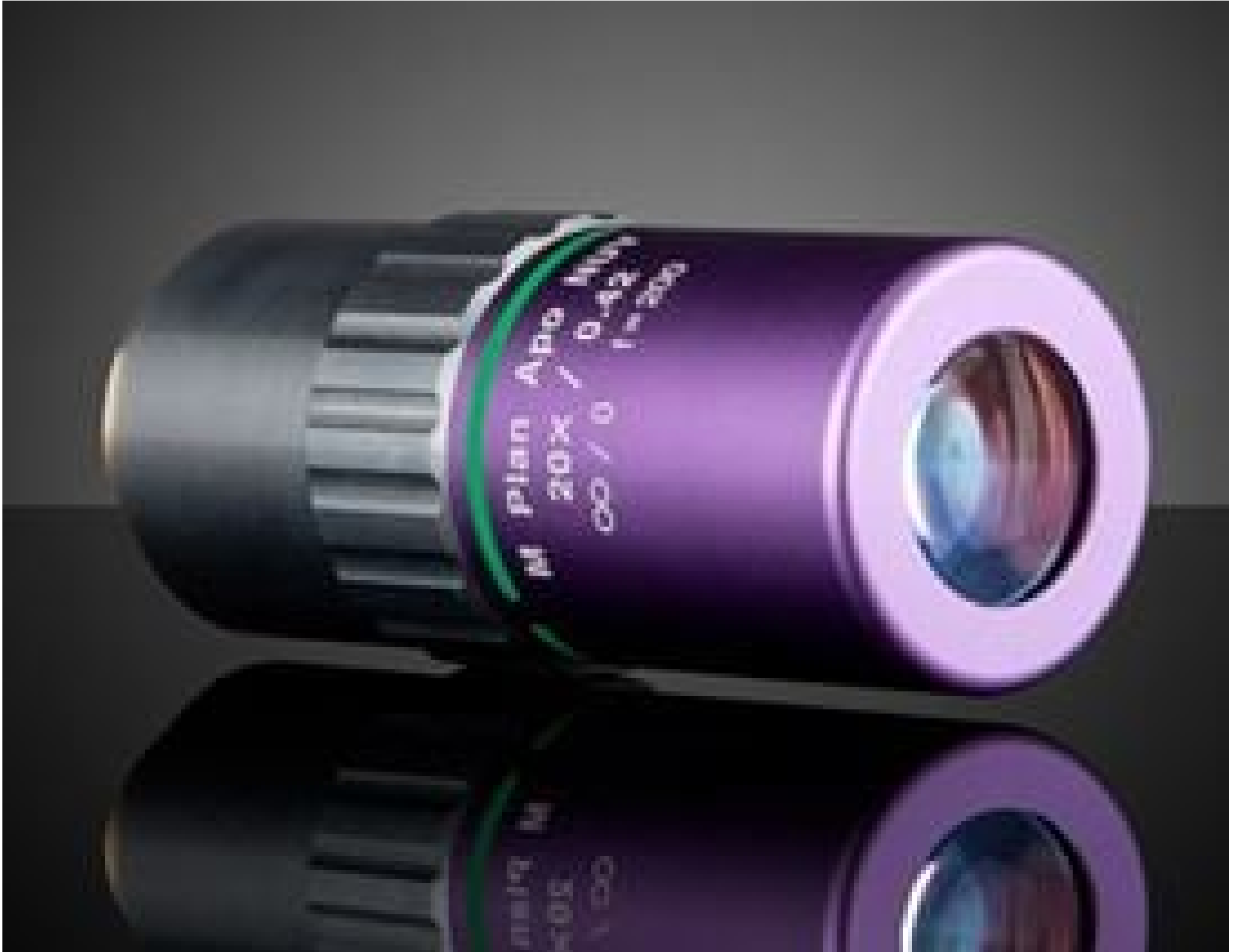
20X Mitutoyo Plan Apo NUV Infinity Corrected Objective, #46-407