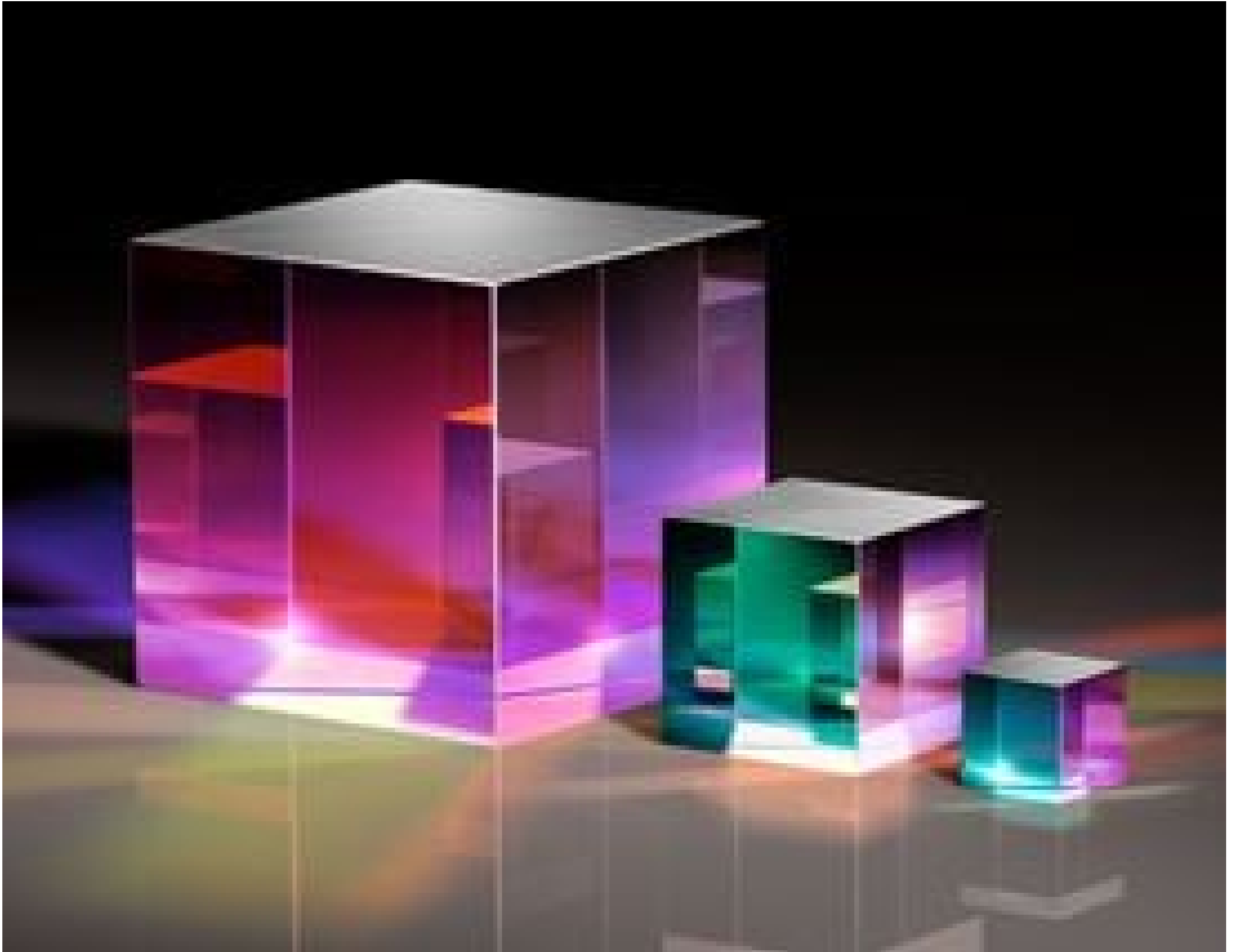
TECHSPEC Laser Line Polarizing Cube Beamsplitters