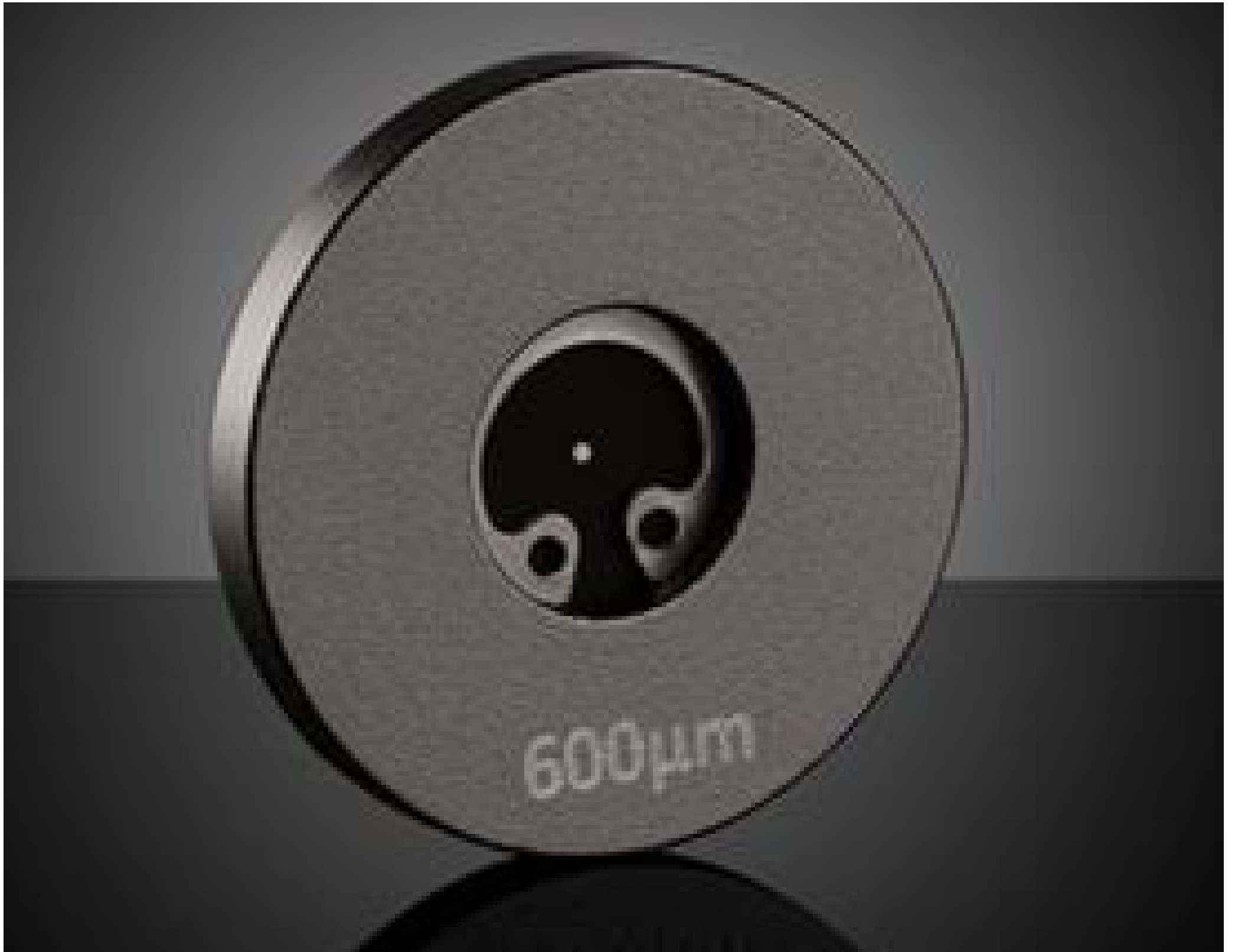
Acktar Blackened Pinholes (mounted)