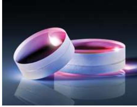
#32-500 - 30mm Dia. x 100mm FL, MgF 2 Coated, Achromatic Doublet Lens ₹14,630