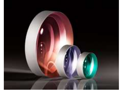
#45-014 - 12.0mm Dia. x -12 FL, Uncoated, Plano-Concave Lens ₹3,380