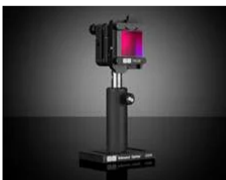
Adjustable Grating Mounts