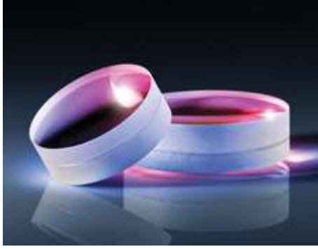
#32-492 - 25mm Dia. x 125mm FL, MgF 2 Coated, Achromatic Doublet Lens ₹12,309