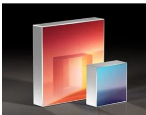
Reflective Holographic Gratings