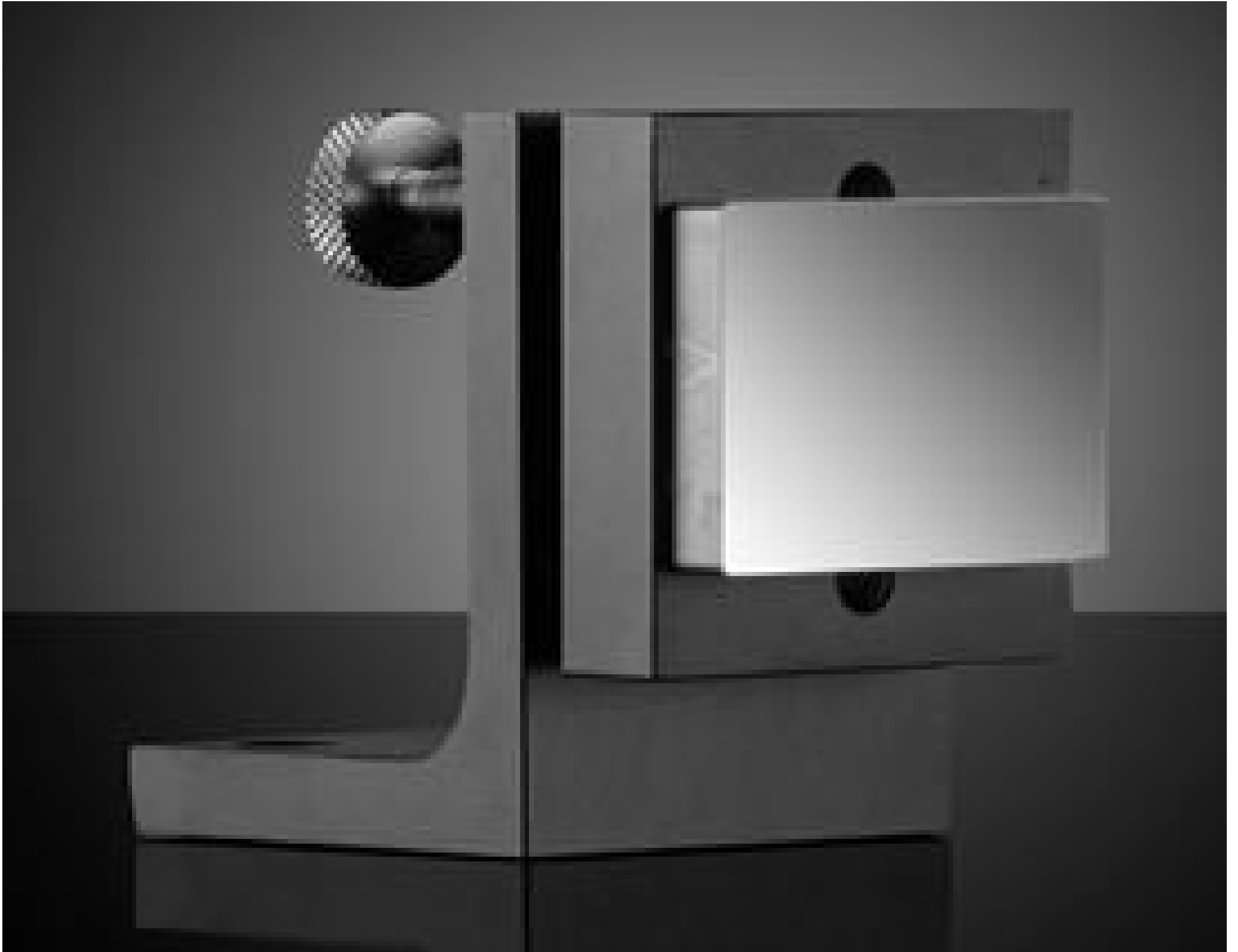
1.5" Reverse Angle Mirror Mount with Mirror