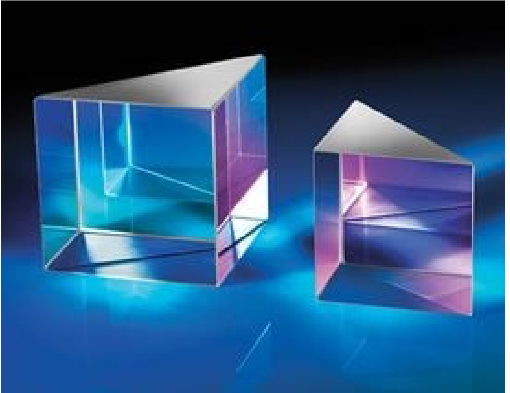
N-BK7 High Tolerance Right Angle Prisms